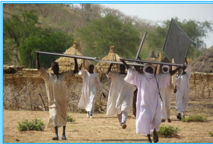
Teachers received new blackboards for the schools in the Goz Beida district.

At the same time, UNICEF has continued distribution of learning and teaching materials in November, with 100 school blackboards along with 50 mats for the schools in the refugee camps in Djabal and Goz Amir. UNICEF and partners also supported displaced parents in an effort to rehabilitate the preschool in Gassiré B. At the same time, UNICEF distributed 50 tarpaulins for maintenance and rehabilitation of school structures and hangars throughout the sites.