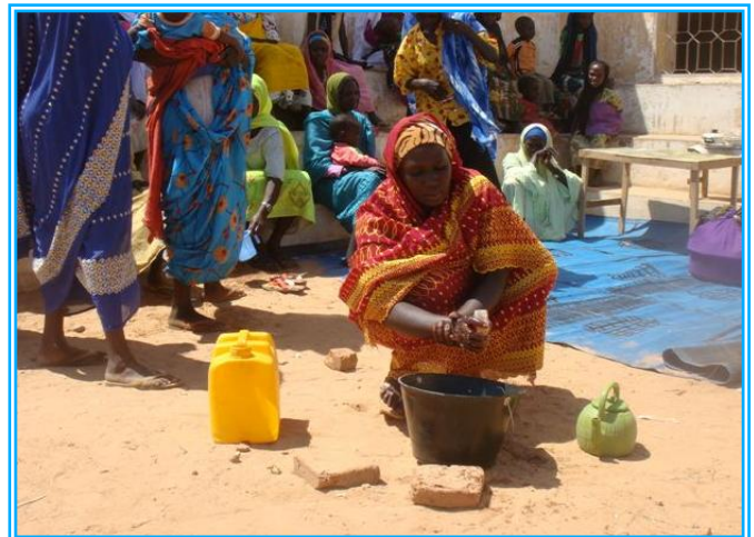
Handwashing with soap demonstrations held by a women's group in Goz Beida during Global Handwashing Day on 15 October.

Despite the challenges in Adé, the WASH Cluster has nevertheless maintained efforts in all other areas towards hygiene promotion, including through continuing and regular distributions of soap across different IDP communities. A total 58,831 bars of soap were distributed this month in Goz Beida and in Kerfi, with support from NGO partner World Concern. A further 76,000 bars of soap were also transported to Koukou Angarana for distribution by Intermon Oxfam in the different IDP and refugee sites in Aradib, Habilé and Goz Amir. Distributions by Intermon Oxfam will be bundled with sensitisation to raise and maintain awareness of best hygiene practices. Overall, throughout the area of Goz Beida, UNICEF and its partners in the WASH Cluster work to support and improve the living conditions of over 60,000 IDPs.