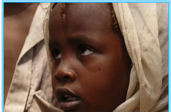
A young girl in Goz Beida.

The first three weeks of November saw 52 refugee and IDP children newly admitted for nutritional support provided in Supplemental Feeding Centres, along with 22 in the Ambulatory Feeding Centres and 8 in the Therapeutic Feeding Centres, which handles the most severe cases. This represents a drop compared to figures in October - most notably looking at Severe Acute Malnutrition - which is consistent with a nutritional screening effort conducted this month which showed a slight decline in the overall Global Acute Malnutrition (GAM) levels. This drop should however be nuanced due to population movements in the current harvest season, as the survey could only cover 66% of the targeted population while for lack of resources UNICEF has not been able so far to actively canvass host communities for screening. Efforts nonetheless continue, with the admission also in November of 341 pregnant and breastfeeding women in nutritional supplementation programmes supported by UNICEF in Goz Beida.