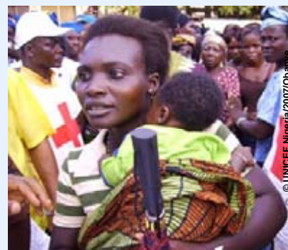
A mother holds her baby as she waits for assistance at one of the camps in Anambra State.

In mid-September forty-two communities in Anambra West and East Local Governments Areas (LGAs), were hit by the floods which displaced an estimated 22,000 persons. Some were reported to have drowned. Schools, houses, health centres and churches were submerged by the flood. The high waters made it particularly difficult for emergency services to reach the large number of people that were affected. For weeks, movement to the affected communities was only possible by canoe while some communities remained inaccessible