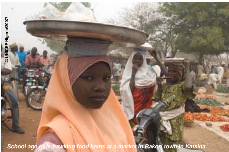
School age girls hawking food items at a market in Bakori town in Katsina

Many girls that do not attend school in Northern Nigeria are sent to 'Islamiya' schools where they receive religious training from the Qur'an. The