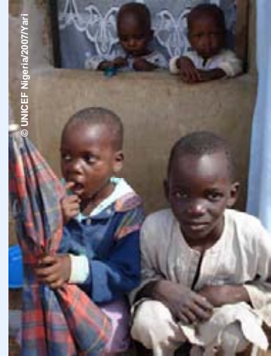
Children displaced by the floods in Bauchi State.

UNICEF staff visited the camps in Plateau, Bauchi and Borno States and gave de-worming tablets to children and pregnant women there.