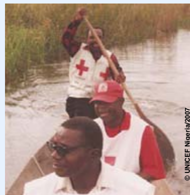
UNICEF partnered with the Red Cross to reach areas left inaccessible by the floods in Anambra State.

In mid-September forty-two communities in Anambra West and East Local Governments Areas (LGAs), were hit by the floods which displaced an estimated 22,000 persons. Some were reported to have drowned. Schools, houses, health centres and churches were submerged by the flood. The high waters made it particularly difficult for emergency services to reach the large number of people that were affected. For weeks, movement to the affected communities was only possible by canoe while some communities remained inaccessible