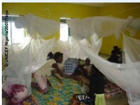
One of the female rooms at the Lagos camp with Long Lasting Insecticide Nets donated by UNICEF.

Continuous rainfall caused a major flood in Ogun State at the end of July. Many houses and bridges along the river bank were washed away, rendering occupants of over 260 houses homeless. About 472 families were displaced. The State Government responded immediately to the situation, organizing a camp for affected persons at the State Technical College, Oke-Iba, in Abeokuta, the State capital. By