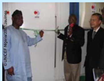
UNICEF Assistant Country Representative, Lagos State Commissioner for Health and Japan Embassy Minister Commissioning the new walk-in cold room for Lagos State

New 'walk in' vaccine cold rooms were commissioned in Lagos and