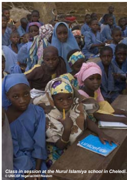
Class in session at the Nurul Islamiya school in Cheledi.