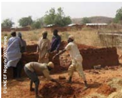
School based management committee members of Dagwarga Ubandawaki building a library for the school.

After a grueling two-hour journey on a rocky desert path, we arrived at Dagwarga Ubandawaki, a rural community in Sokoto State. Normally, we would go to see the village head first but this time we headed for the school premises, attracted by a group of men working on a building construc-