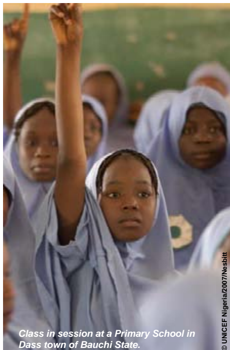
Class in session at a Primary School in Dass town of Bauchi State.