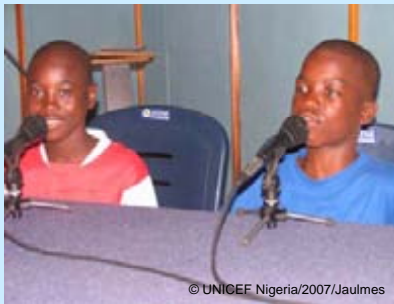
Children living on the streets of Lagos record a programme in the FRCN studio as part of a UNICEF supported training workshop.

UNICEF has supported the Child-to-Child network and Radio Nigeria, to mobilise, counsel and train 45 street children in basic media skills and radio production techniques so they can poignantly and with minimum support tell the stories of their lives, their fears, frustrations and hopes for the future.