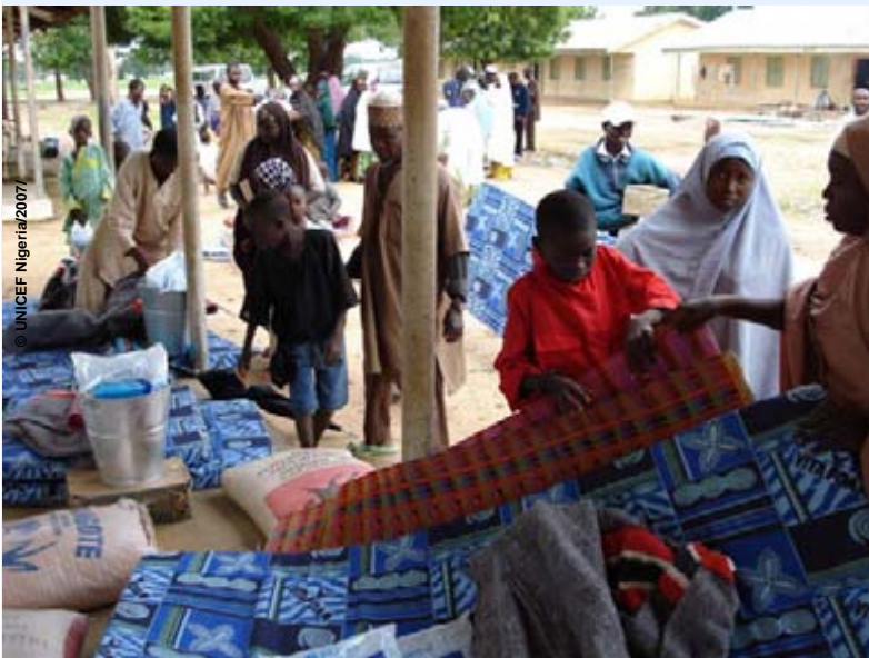
Families displaced by the floods take stock of supplies provided by UNICEF at a camp in Misau local government area of Bauchi State.

Following heavy rains which swept through the ten states supported by the UNICEF Field Office in Bauchi, over 100,000 persons are believed to have lost their homes, hundreds of acres of farmlands, crops, livestock and other valuable property. Water sources were polluted, schools, places of worship and bridges were destroyed. Many people were also reported dead. Plateau was one of the worst hit with 56,571 persons estimated to be affected and over 100 deaths reported. In Bauchi, 12 LGAs were inundated and an estimated 31,000 persons displaced, mainly women and chil-