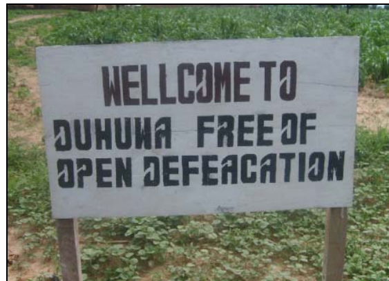
Figure 1: An Open Defecation Free CLTS Community (Duhuwa, Jigawa State)

As CLTS programmes mature and expand, specific challenges have been identified and project designs are being modified accordingly. A key problem is the application of the CLTS approach in larger communities and in urban or semi-urban areas. In both cases a lack of community cohesion hinders the use of CLTS tools and limits progress. Other challenges include the difficulty in building low-cost latrines in technically difficult conditions such as in collapsing soils and in riverine areas. There have also been reports of “second generation” problems with CLTS low-cost latrines,