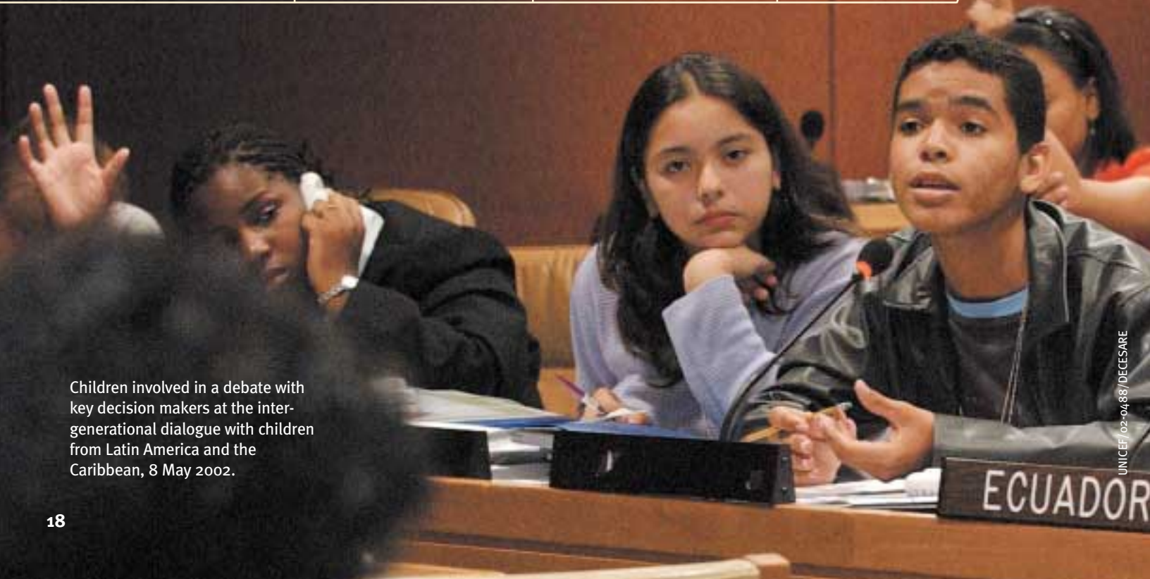
Children involved in a debate with key decision makers at the inter-generational dialogue with children from Latin America and the Caribbean, 8 May 2002.