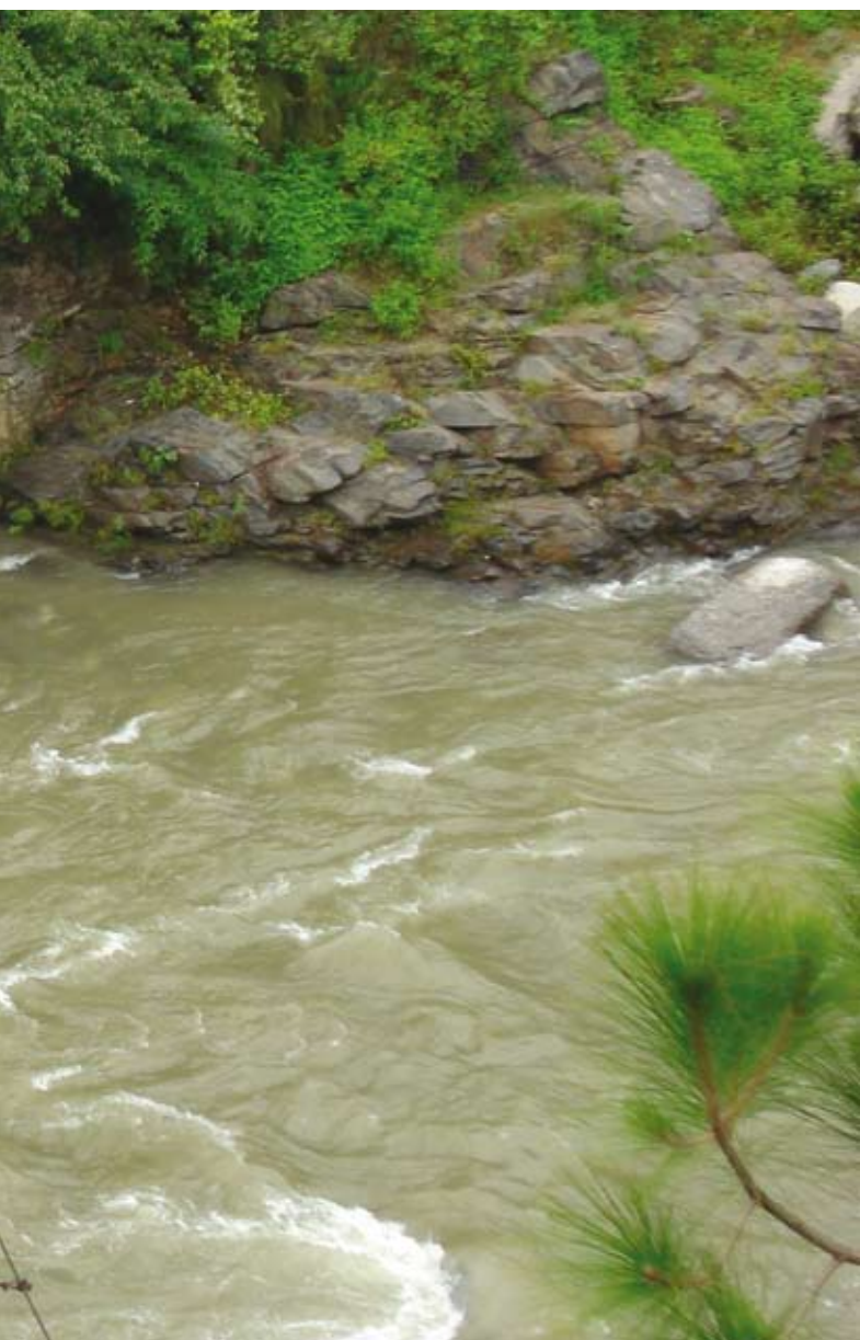
These children are not victims of trafficking.

Many legal and policy initiatives in South Asia combine trafficking with migration or do not investigate the relationship between these two distinct phenomena. Human trafficking must be distinguished from migration as well as from human smuggling. Trafficking involves exploitation as a matter of definition in a way illegal migration and smuggling do not. Whereas illegal migration and smuggling necessarily involve crossing state borders without state permission, trafficking does not. Persons may be moved within the borders of a country or may enter another country with a valid visa but nonetheless end up in exploitative situations. Trafficking often involves persons who want to migrate, either within the country or to another country, but who are