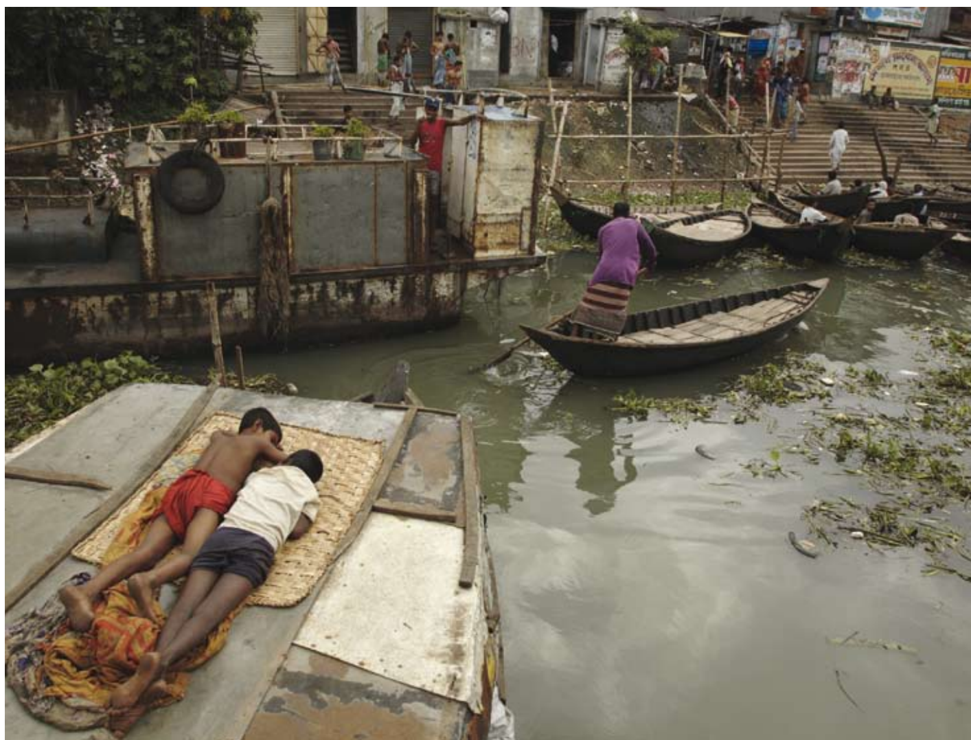
These children are not victims of trafficking.

The countries in South Asia have entered into several regional agreements concerning human trafficking. All countries are members of SAARC and are signatories to its conventions on preventing and combating trafficking of women and children in prostitution and promoting the welfare of children, as earlier discussed. Another important regional commitment on child trafficking is the 2001 South Asia Strategy against Commercial Sexual Exploitation of Children and Child Sexual Abuse.