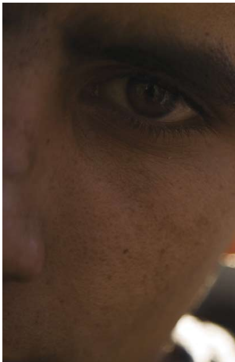
These children are not victims of trafficking.

National legislation in most South Asian countries often addresses trafficking within the context of sexual exploitation of women and girls, mostly in regard to prostitution. Although this is an area of great concern, limiting the focus to sexual exploitation has resulted in limited attention being paid to trafficking into other forms of exploitation. Likewise, children who are sexually abused in the course of migration or contexts other than trafficking are largely neglected. There is also a tendency to overlook trafficking of boys for sexual exploitation.