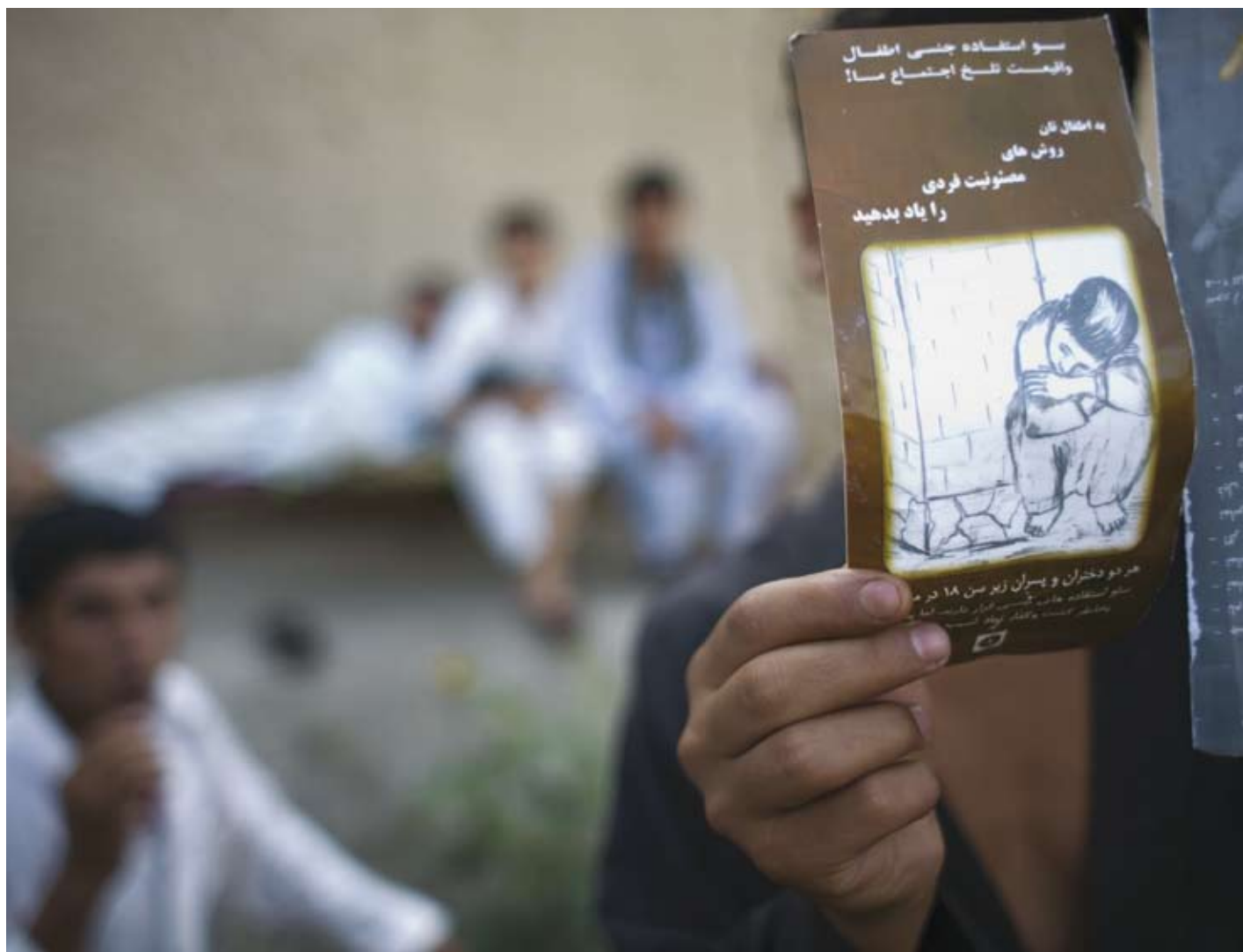
This child is not a victim of trafficking.

should be taken to address discriminatory laws and policies and to ensure equitable access to quality services for national and non-national children, including those who are undocumented. The Convention protects not only children who are citizens of a State party but all children under the jurisdiction of the State, irrespective of children's nationality and of whether or not they have been trafficked. General Comment No. 6 on the Treatment of Unaccompanied and Separated Children Outside their Country of Origin, issued by the Committee on the Rights of the Child in 2005, stresses that states should not discriminate against migrant children and should ensure their right to maintain their cultural identity and values, which includes maintaining and developing their native language. Furthermore, child-friendly information and services must be provided that reflect children's diversities, such as gender, age, ethnicity, national origin, caste, religion, sexual orientation and ability status. Awareness of discrimination and the