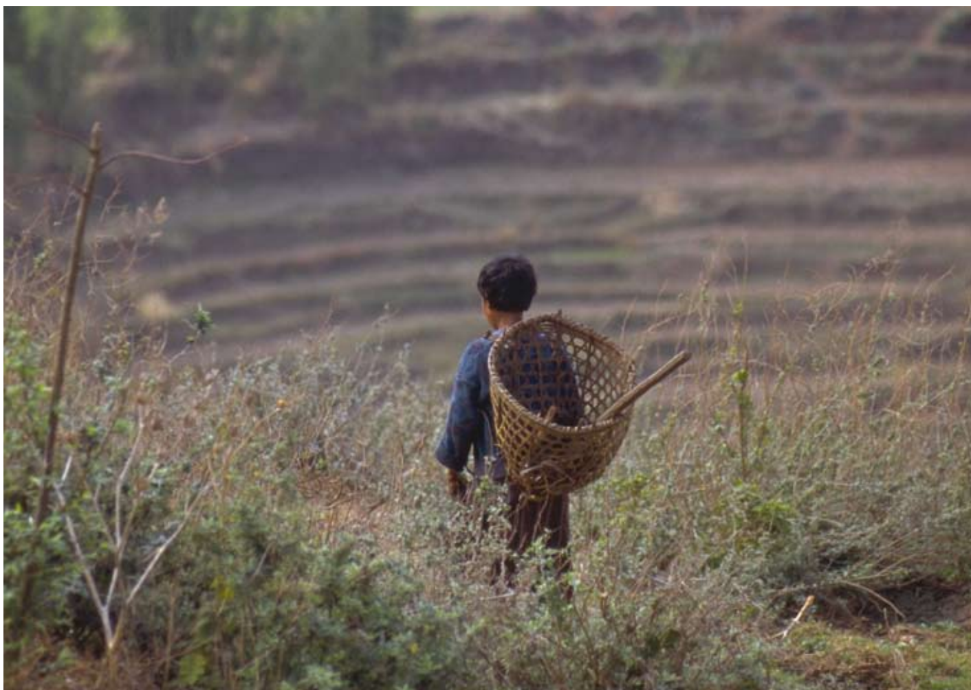
This child is not a victim of trafficking.

Few countries have reformed their judicial processes to make them child-friendly. Legal remedies for victims are lacking, as are formal witness protection structures for children who are victims of trafficking and other forms of exploitation and abuse. This includes children who cooperate with law enforcement. Children receive insufficient legal information and assistance, and are often excluded from participating in the development and evaluation of rehabilitation programmes. In countries where child-friendly measures are in place, such as Bangladesh and Nepal, in camera proceedings protect the child's privacy and psychological well-being. In India, the Goa Children's Act, 2003 enables the establishment of special tribunals in every district to fast-track the prosecution of offenders. The Act also ensures that the child's identity is protected in all public dissemination of the legal proceedings ( see box 2.1, page 12 ).