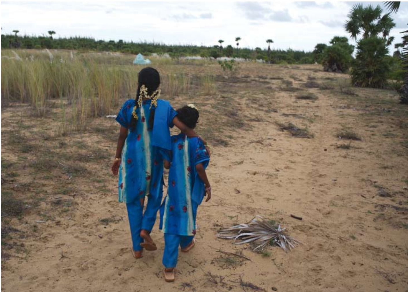
These children are not victims of trafficking.

Factors such as age, gender, ethnic origin, caste, sexual orientation and ability status are often interconnected grounds of discrimination. Discrimination on a single or on multiple grounds may increase children's vulnerability to abuse, exploitation and trafficking, requiring a different combination of prevention and protection measures. These include access to shelters for children with certain disabilities, and the provision of information and education material in minority and indigenous languages.