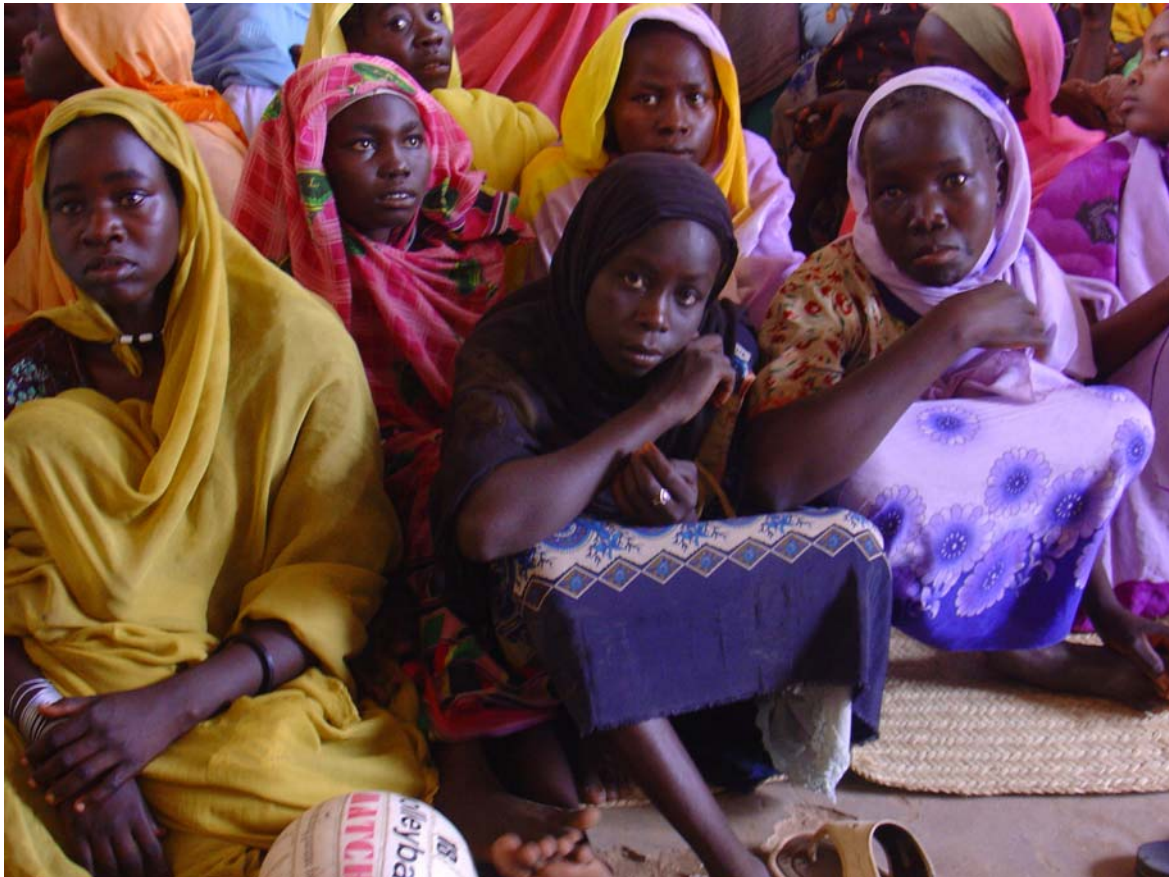
Adolescent girls and women in Kass, while speaking about sexual gender base violence. (August 2, 2004)

UNICEF Sudan in collaboration with: The State MSW, MoE, CFCI, SPCR, SRC, EDM, ICRC, IRC, SC-US, SC- UK, SC-Sweden, NRC, WV