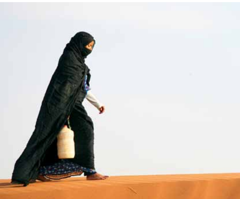
If water, food and fuel insecurity intensify as a result of climate change, adolescents, most often girls, can expect to bear the brunt of the additional time it will take to acquire drinking water. A 16-year-old girl carries a jug of water across the sand towards her family's nomadic compound in the Sahara Desert, Morocco.

Two other facts are clear. The first is that this generation of adolescents will bear a major portion of the burden and cost of mitigating and adapting to climate change. Adolescents will be harder hit than adults simply because 88 per cent of them live in developing countries, which are projected to suffer disproportionately from the effects of rising global average temperatures. An estimated 46 developing and transition countries are considered to be at high