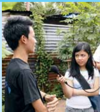
Youth reporters record a segment for Kabataan News Network, Philippines.

“In 2009, the country was home to almost 20 million adolescents between the ages of 10 and 19.”