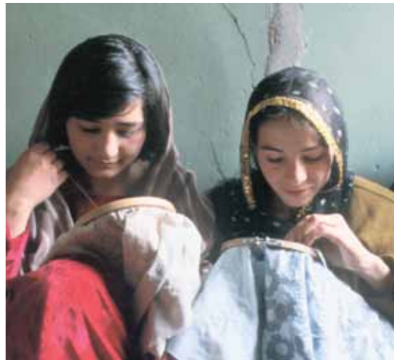
Young people can use their knowledge and skills to contribute in their homes, schools and communities. Adolescent girls learn to do embroidery in a home-based school in the Khairkhana neighbourhood of Kabul, Afghanistan.

Countries across the developing world have taken up the challenge of tackling youth unemployment, primarily by establishing initiatives to enhance skills. Using the YEN recommendations, Uganda's Ministry of Education and Sports, the Kampala City Council and Germany's international development agency (GTZ) developed a curriculum to