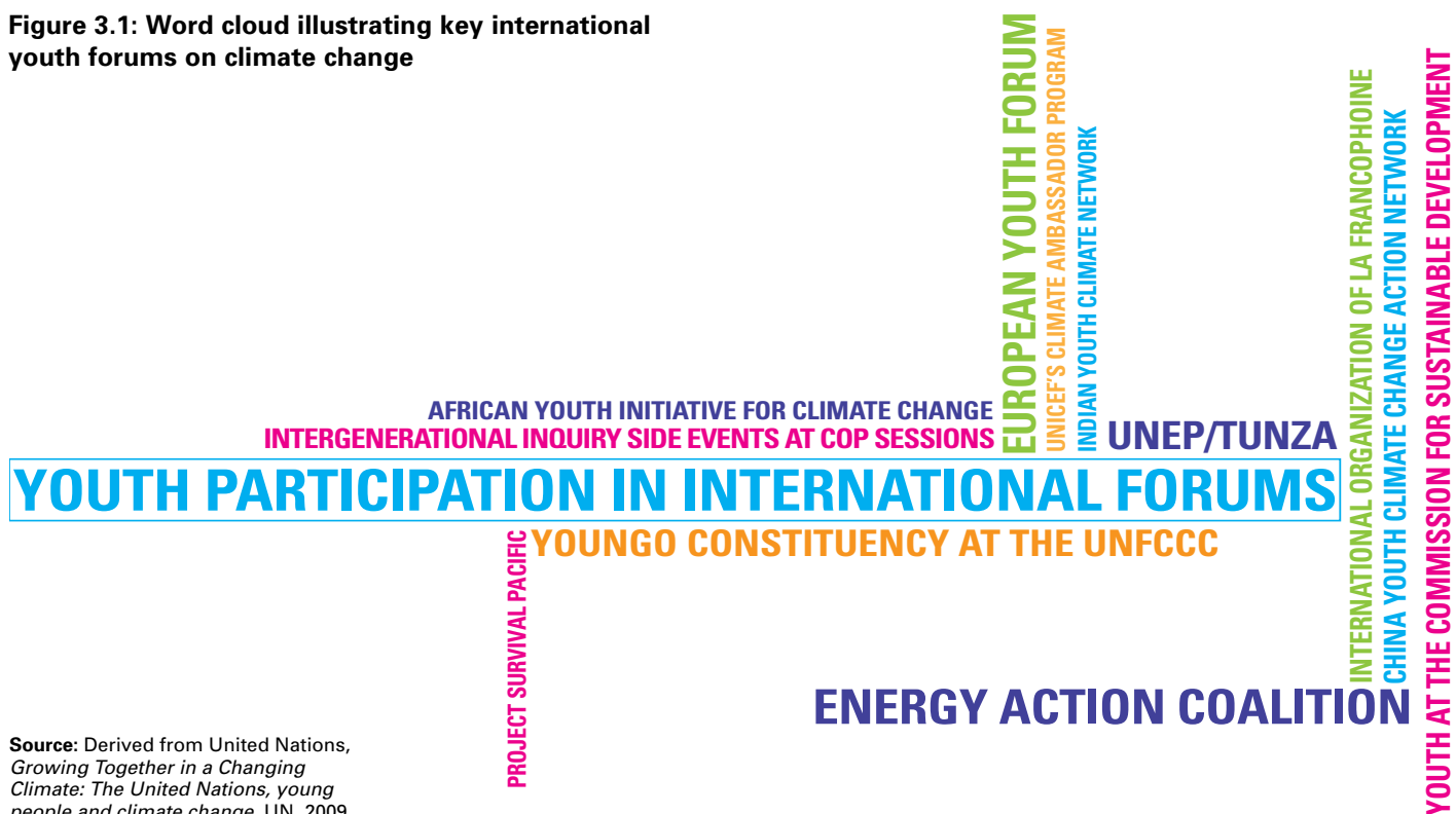
Figure 3.1: Word cloud illustrating key international youth forums on climate change