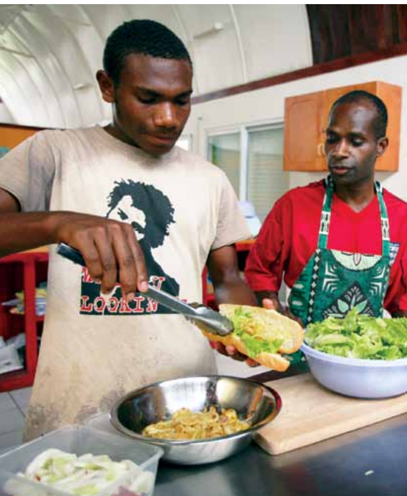
Vocational training enables adolescents and young people to acquire marketable skills. A 16-year-old boy makes a sandwich while his instructor watches during a cooking class at the Wan Smolbag Theatre Centre in Tagabe, a suburb of Port Vila, Vanuatu.

Almost one quarter of the world's working poor were young people in 2008; moreover, these 150-million-plus young poor workers tended to be predominantly engaged in agriculture, which left little time for them to gain the skills and education that could improve their earnings potential and future productivity. While education and demographic trends were easing pressures on youth in regional markets for most of the first decade of this century, the youth labour force continued to expand in the most impoverished regions of sub-Saharan Africa and South Asia. Across the world, however, youth employment trends were fairly bleak, particularly in CEE/CIS and the Middle East and North Africa regions.