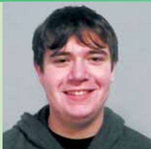
by Cian McLeod, 17, Ireland

“Girls who are disabled run a greater risk of physical and mental abuse.”