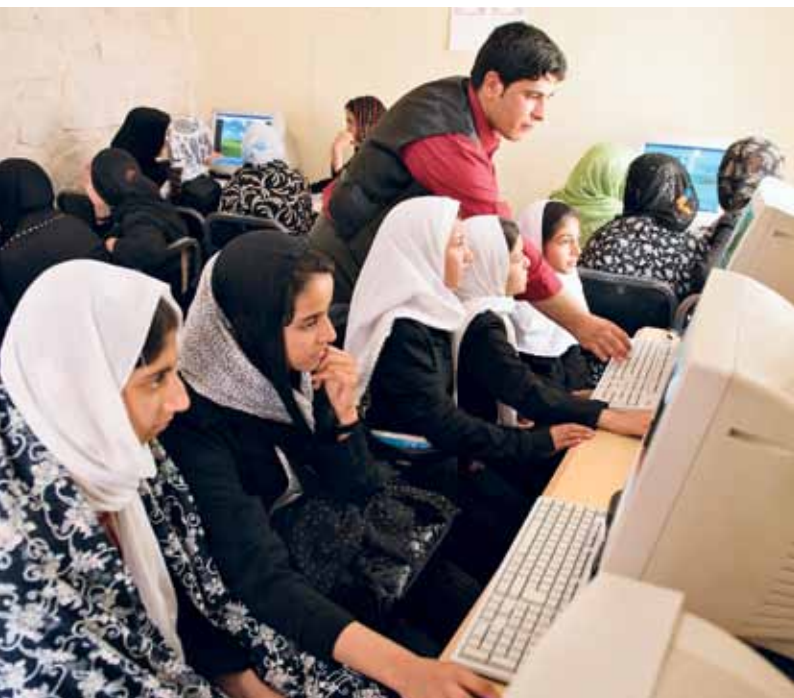
Information and communication technology offers the potential to remove barriers to education and literacy. Young women who are youth volunteers learn computer skills at a computer and literacy training centre run by the Afghan Red Crescent Society.

ethnic minorities. And in some societies adolescent girls may also find it more difficult than boys to gain access to the technology itself and the training necessary to harness it, owing to factors similar to those that tend to exclude girls from education and equal participation in household and community life.