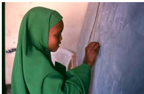
UNICEF supports efforts to boost girls' enrolment in Somalia.

participated in workshops that reviewed mentoring of CECs.