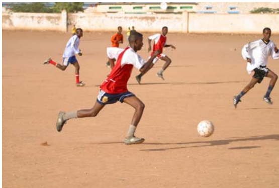
Football was one of the main activities to mark the International Day of Peace.

International Day of Peace: The Day was marked on 21 September in various parts of Somalia. Activities included parades, road races, cultural performances basketball, volleyball and football tournaments, debates and advocacy meetings.