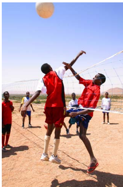
UNICEF supports sports initiatives through its youth programme. Credit: Giacomo Pirozzi.

Rehabilitation: A basketball sports ground rehabilitated by UNICEF in Tiyeglow continues to be a hub of sports activities in the community. Youth in Tiyeglow also use it for volleyball.