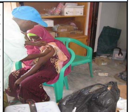
A woman gets TT vaccination during a CHD campaign in Somalia.

For those whose wives had not yet received TT vaccination we then went on to discuss the need to have them vaccinated. Some of the participants we spoke to mentioned that their wives were already pregnant and wondered whether it was not too late to receive the TT vaccine. We responded to queries continuously even during Child Health Days and our efforts surely added to the number of targeted child-bearing age women reached, but we still need to spread the word more by working much closely with UNICEF in order to have more receive TT.”