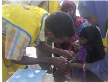
A girl gets a protective jab during the Child Health Days campaign in Somalia.

multi-sectoral (health, water, sanitation, nutrition inputs).