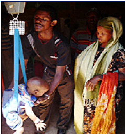
A child is weighed at the outpatient therapeutic centre in El-Berde, Somalia.

El-Berde, located near the border with Ethiopia in the Bakool region of southern Somalia, is one of the towns that has been receiving an increasing number of people displaced by armed conflict.