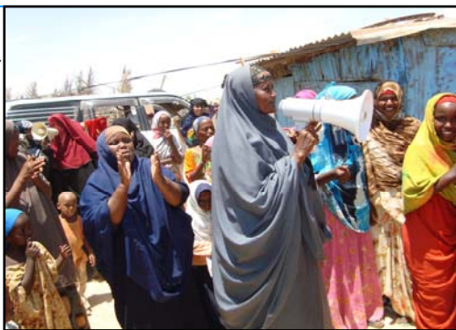
Social mobilizers at work to support the Child Health Days (CHDs) in Somalia.

Since it involves Somalis who know their culture, they are able to use their tone and voice adequately. This technique has