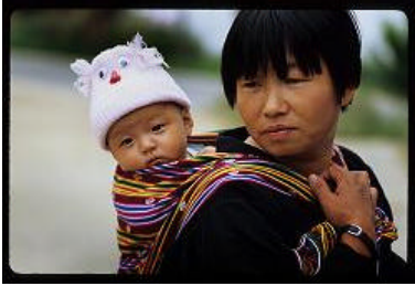
Mother and child