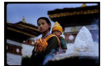
Mother and child