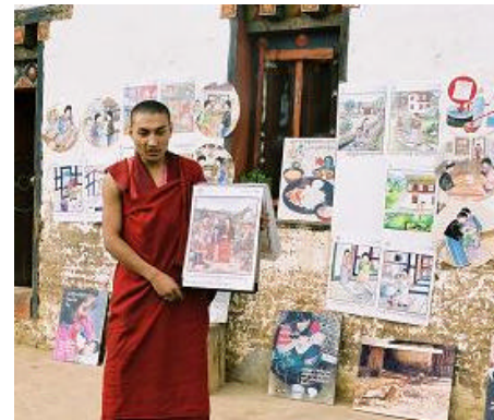
Monk providing HIV/AIDS education