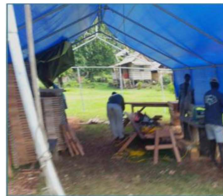
Men at Work

As per quality checks on this furniture the standard is in accordance with the design specification requirements, this is achievable with the use of electrical