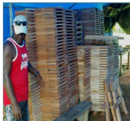
Quality Control Inspection

According to Gorae, he is planning to go over to Mono to start the furniture production for Falamae Primary School before coming over to the schools that are located in the Alu Island Schools.