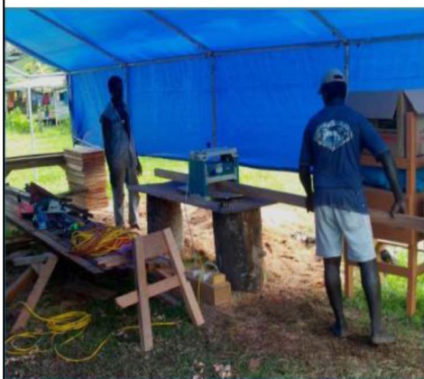
Have tent—Can Make!

* The tent workshop shown in these photos is in fact utilizing the previously supplied temporary school tent frames from UNICEF. These were supplied shortly after the earth quake / tsunami of April 2007)