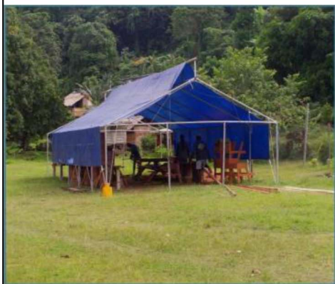
Tented* furniture workshop Toumoa Village

Timber Production for the Shortland Islands Schools is being purchased from communities and will be milled following the satisfactory identification of only reliable supplies. Timber for the following schools has been purchased and is now ready for construction once all hardware are shipped namely Nila, Pirumeri and Falamae Primary School.