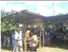
Gifts of Appreciation for Guests

(*TEES—Task Force on Education in Emergency Situation)