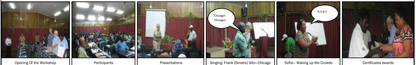
Opening Of the Workshop