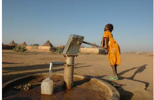
UNICEF collaborates with the State Water Corporation (SWC) in the construction and maintenance of water supply systems that provide safe water to the conflict-affected population.

In addition to provision of latrines, other sanitation interventions includes clean-up campaigns, provision of waste disposal bins, supporting construction of onsite garbage pits, transportation and disposal of garbage from camps, and spraying for vector control in shelters, latrines and garbage sites.