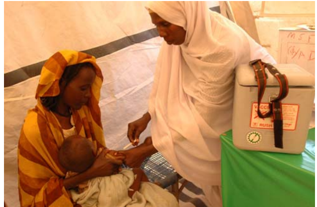
UNICEF is committed to ensuring child survival through accelerated immunization drives for major preventable diseases.

inputs to enable transportation. At the end of June 2005, the average routine coverage reached 50%.