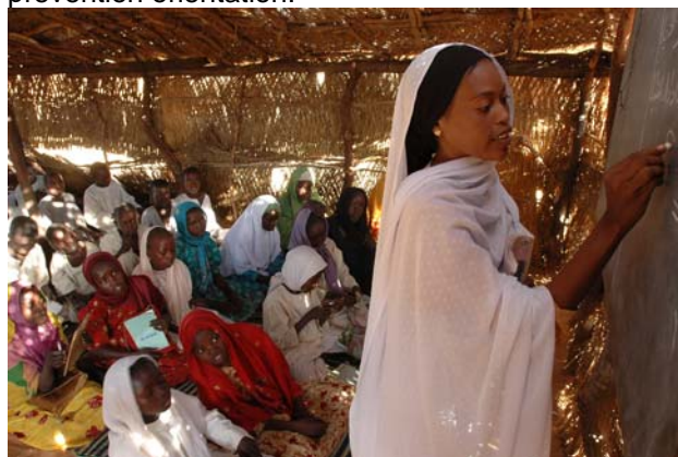
In 2005, UNICEF continues to support classroom rehabilitation and construction, distribution of supplies and expanded teacher training and volunteer teach support programmes.

During the reporting period, UNICEF supported training on child-centred and multi-grade teaching methodologies for 50 nomadic teachers from West Darfur. 30 nomadic communities in West Darfur have been trained on how to form parent teacher associations and have received HIV/AIDS prevention orientation.