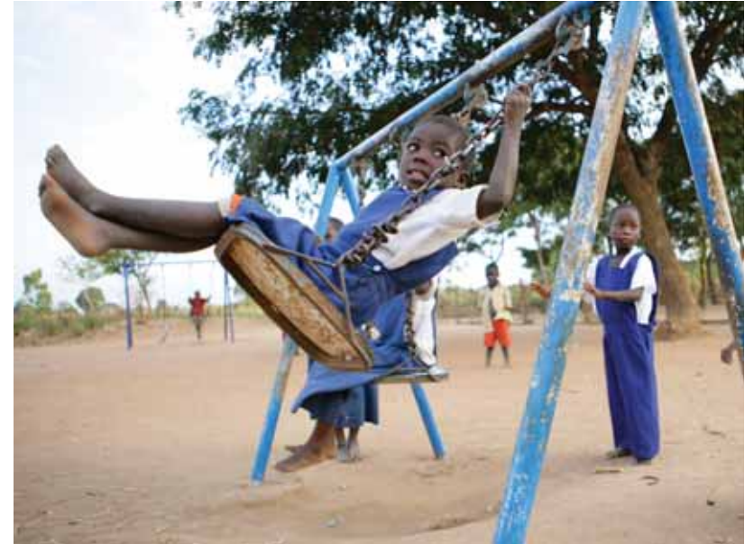
At the Chimteka childcare centre in Mchinji, a small town on Malawi's western border with Zambia, a group of young children shriek as they play on slides and swings and kick a ball in the spacious grounds.

Governments: Australia, Belgium, Canada, Netherlands, Norway, United Kingdom. UNICEF National Committees: Germany, Luxembourg, Norway, Spain, Sweden, Switzerland, United Kingdom, United States. Other Sources: UN Fund.