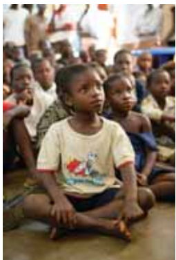
One in 11 pupils at Kafulu Primary School has lost one or both parents.

as the school clubs, out-of-school youths are targeted in other ways, through youth clubs and Youth-Friendly Health Services (YFHS), which are clinics providing sexual and reproductive health information and services in a non-judgemental and sensitive manner.