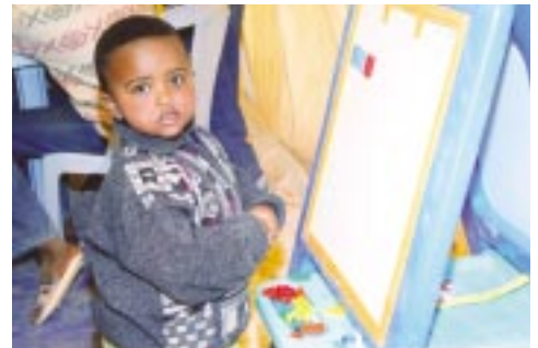
Refugee child playing in TCN camp

These education tents are fully equipped with furniture and supplies such as Arabic, science, maths and English textbooks as well as