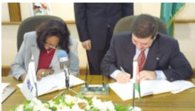
Jordan & Unicef sign a cooperation agreement

In addition to its traditional partners such as the Ministries of Planning, Health, Education and Social Development and major non-governmental organisations, UNICEF will work closely with other partners including the Higher Council for Youth, the Jordanian Department of Statistics, the National Council for Family Affairs, the Ministry of Awqaf and Islamic Affairs and Holy Places, the Ministry of Interior in addition to grass root organisations and governance structures especially in Irbid, Zarqa and Mafrak.