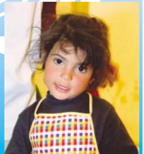
Little refugee girl in Unicef-supported tent