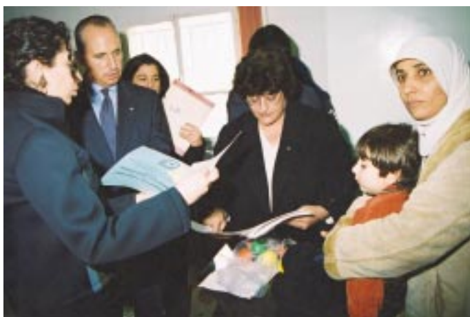
Sheraton GM speaking with mothers & children in CBR Programme

"Give Us A Push" was initiated in Europe, Africa and the Middle East last year- Its focus is to raise funds for UNICEF's maternal and neonatal tetanus campaign. In Jordan the funds raised by the Sheraton Hotel employees have been used to purchase much needed equipment for children undergoing Community Based Rehabilitation.