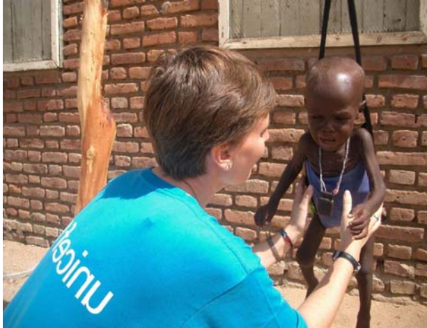
Child is assessed for severe malnutrition, S. Darfur