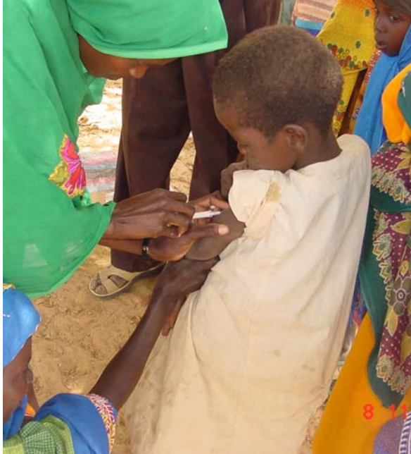
Child is immunized against measles in SLMA area of N. Darfur.

Preparedness and Response (EPR) National Meningitis Task Force with the provision of A & C vaccines and support for immunization drives. At present, there is speculation regarding the total cases in Darfur. As of early February, two cases were confirmed in Saraf Umra, two suspected in Abu Shouk camp and one suspected in El Fasher rural. UNICEF, WHO & SMOH are participating in outbreak response meetings in each state and assessing the feasibility and impact of a meningitis vaccination campaign. In Eastern Chad, a 12-day drive has already been completed with nearly 72,000 people in and around the Treguine, Bredjing, Farchana camps reached.