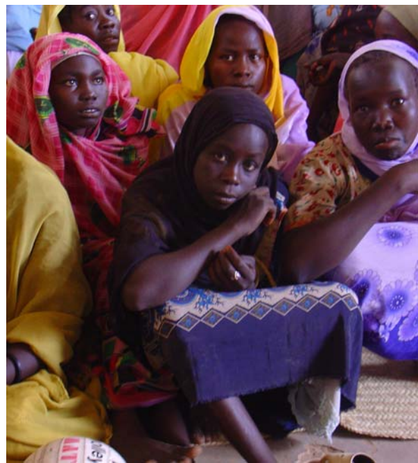
Adolescent women speaking about SGBV in Kass, August 2004

The alarming level of sexual violence occurring in the context of the current conflict has been widely documented, even though no accurate figures exist. However, despite efforts of different agencies, the services to respond to the needs of sexual violence survivors remain woefully inadequate. The need for an inter-agency, multi-sectoral approach to GBV has become a matter of urgent priority.