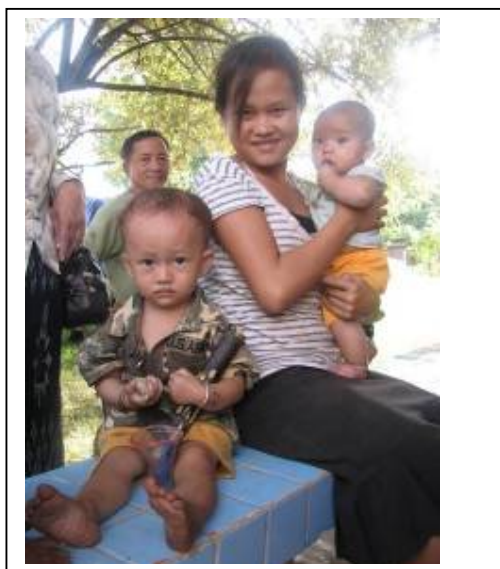
Family at flood relocation centre, Vientiane province

There is also concern about vaccine preventable diseases such as measles, polio, and tetanus due to unsanitary conditions and to the fact that routine immunization coverage was very low prior to the floods. Moreover, dermatitis and conjunctivitis caused by exposure to flood water and close contact with others as a result of overcrowding, as well as respiratory infection may arise.