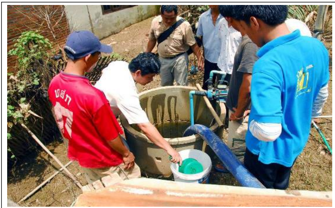
Decontaminating flooded well, Vientiane province