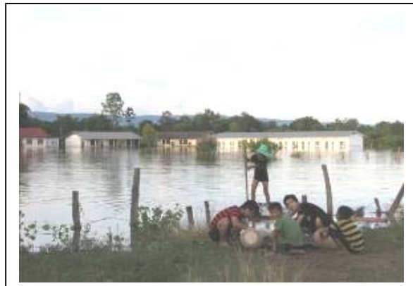
Flooded school, Vientiane province

Schools were closed for regular holidays during the height of the flood, but were scheduled to reopen again from 1 September onwards. Available data from the Ministry of Education identified approximately 136 primary schools in 21 districts in six provinces that have been seriously damaged by the storms and flooding. In approximately 45 villages with the most severely damaged primary schools in Vientiane capital, Vientiane, Borikhamxay, and Khammouane provinces, the opening of the school year has been delayed until the schools can provide a safe and healthy environment protected from wind, rain and muddy floors. Schools constructed from less durable material such as straw and bamboo have suffered the brunt of the damage and need to be completely rebuilt. In schools constructed from brick and cement, the heavy winds and excessive water damaged the roofing sheet roofs and cement floors and walls. Approximately 91 schools in the provinces mentioned above and Oudomxay and Xieng Khouang, although operational, are also moderately to severely damaged and will need to be repaired to ensure a safe and healthy teaching and learning environment for the children and teachers.