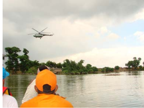
Food packets are dropped by helicopter in East Champaran district