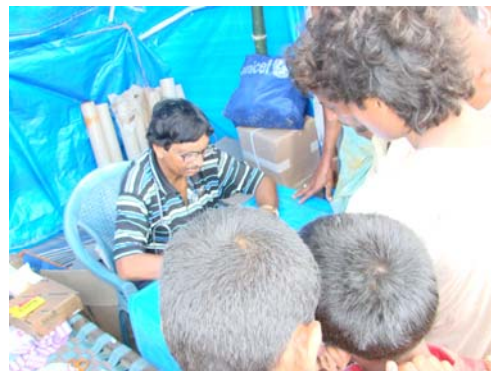
Health Camp organized at East Champaran district