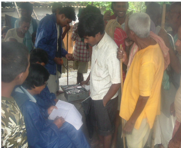
Medical camps being organised to deal with flood related ailments and casualties