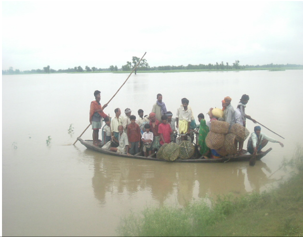
People escaping through inundated road in over-crowded boats

Situation- Although there has not been significant rain in the catchment area of the northern districts of Bihar in the last 48 hours, the situation continues to worsen due to the continuous release of water from Nepal and also due to breaches in the embankments of rivers.