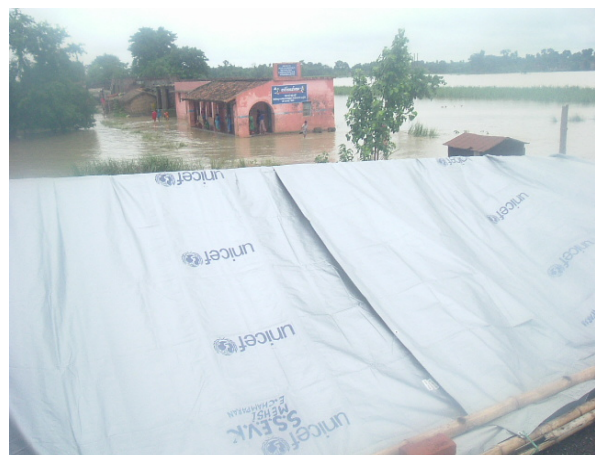
UNICEF tarpaulin sheets providing relief to families from incessant rains