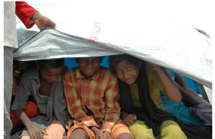
Children in temporary shelter along embankment