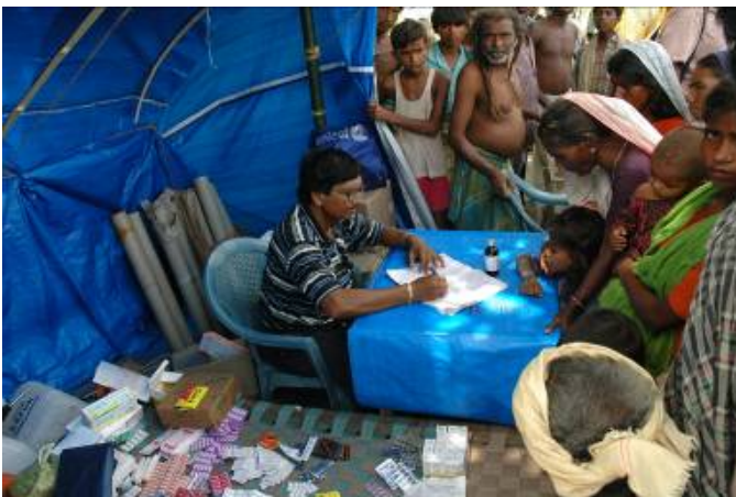
Doctors examining the patients in medical relief camps in East Champaran district