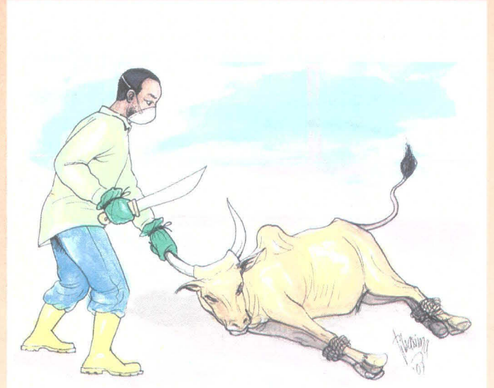
Vaa vifaa vya kinga wakati wa kuchinja, kuchuna na kukagua nyama.