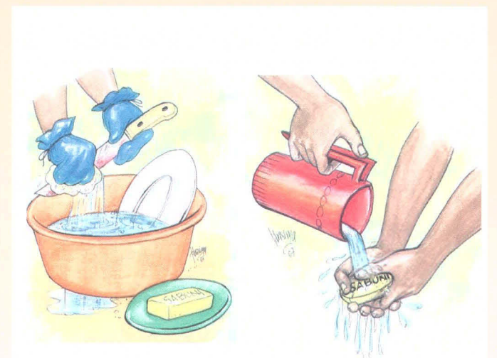
Safisha vyombo na nawa mikono kwa maji na sabuni baada ya kuchinja, kuchuna na kukagua nyama.