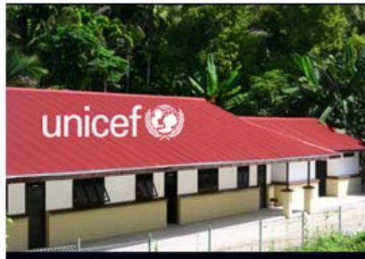
SDN 076102 Soto'o Hilialawa- Nias Selatan

"This is the commitment of UNICEF that we should feel grateful on. Not just a school, it's also accompanied with the facilities including its quality education activities. Nias Selatan would never left behind in terms of development and education. With UNICEF support we will optimistically catch up our steps" proudly said government representative on the grand opening. It's marked the new awakening phase of improving basic education services in Nias Selatan.