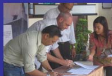
"Hand over assets of rehabilitation and reconstruction project to government of Nias and Nias Selatan District".

At the end of the closure, government of Nias held 'Nias District Thanking Ceremony'. Appreciation was presented by Nias Government to all recovery agencies in Nias including UNICEF.