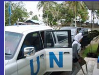
'On the evacuation processes'

Gathered staffs who were practicing the drill, expressed their excitement and the need of improvement on the practice. Included in debriefing point is the need of staff to be always equipped with basic emergency stuff. UN agencies which participated within the drill; UNICEF, UNDP, UNORC, UNOPS, ILO, WFP, & UN Clinic