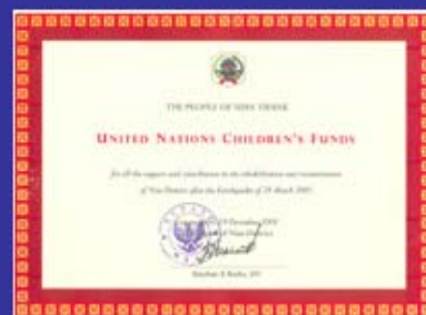
'Certificate of appreciation presented by Bupati of Nias for UNICEF'

BRR (Rehabilitation and Reconstruction Body) Regional Nias office has been officially closed by December 2008. The office closure was celebrated through series closure activities.