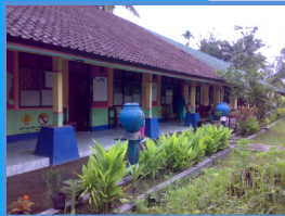
MI NW Puyung

Mainstreaming Good Practices in Basic Education (MGP-BE) Programme has begun to show its results. After trainings for trainers, school supervisors, school principals, teachers and members of school committee were conducted, the programme has been continued by providing support for school level implementation. Supports provided for its implementation are including Capacity Development Fund (CDF) and supporting meeting at cluster or sub-rayon level.