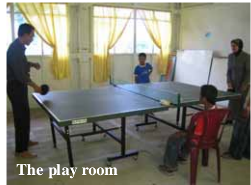
The play room

The total number of 346 sites to which UNICEF has committed, representing 376 school units, have already been handed over to implementing partners. In addition to the 52 already completed schools, 100 are under construction and 55 are under tendering. In order to accelerate the process, UNICEF is working with three implementing partners: UNOPS (213 school sites), Bitu (66 school sites) and Nippon Koei (67 school sites).