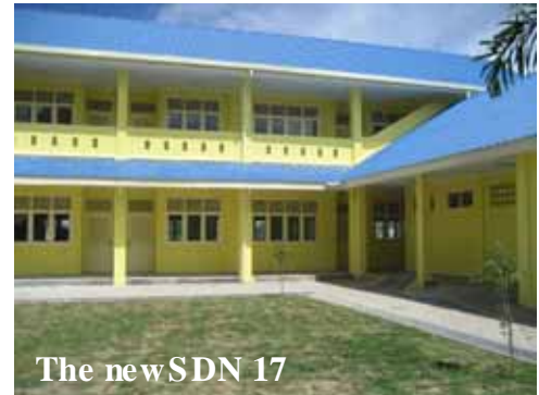
The new SDN 17

UNICEF and the governmental Aceh-Nias Reconstruction and Rehabilitation Agency (BRR) took their cooperation a step further this month by officially signing a revised list of 346 school sites onto which UNICEF has committed to build earthquake resistant and child-friendly schools. The signing is the follow-up to the original agreement from September 2005 between UNICEF and BRR. As part of the colorful ceremony at the newly finished SDN 17 in Sukaraja subdistrict, UNICEF also symbolically handed over its already completed 52 permanent schools.