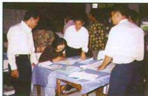
Schools and Communities Working Together to improve their schools and their pupils' performance

Quality Improvement An Example of a class 1 pupil in East Java already writing in his own words