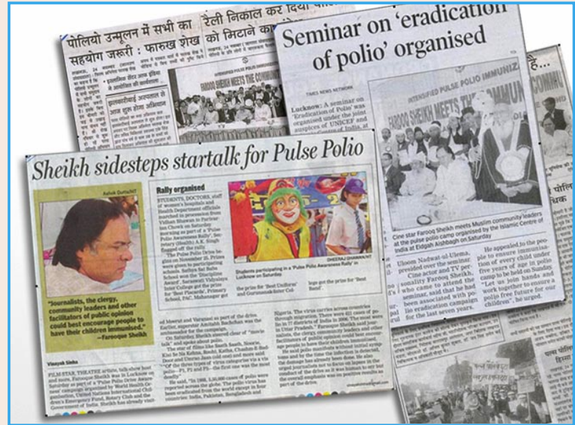
Some of the media coverage on Farooque Shaikh's visit to Lucknow

in positive and neutral media – 46 and 41.5 per cent in Delhi and Mumbai. What is notable, however, is the overall increase in the number of stories reported across the three locations during the months of July to September. For instance, while 186 stories were recorded in Delhi-Mumbai papers in April-June period, as many as 310 stories were recorded between July and September – more than 60 per cent increase. Lucknow and the western Uttar Pradesh districts, too, reported a similar increase indicating a huge media interest in polio. While the reason for this is more cases being reported, a decline in negative media stories around this time shows