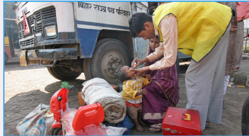
A vaccinator is quick to find a family arrived at the bus station in Bihar before they head home.

children's finger markings (to show if they have been recently vaccinated) were examined before they were given polio drops. This year, only children who came to Bihar from outside the state were vaccinated.