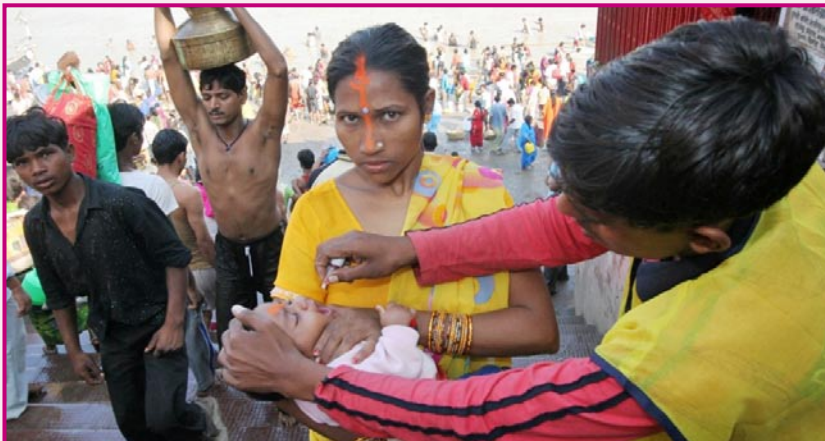
A woman stops to get her child vaccinated before she goes to the "ghat" (riverbank) for Chhath.

The decline in the number of children immunised this year has been attributed to the polio round that concluded three days (November 4) before the Chhath vaccination started (November 7). Last year, the regular polio round took place one month before Chhath so all children were vaccinated. This time,