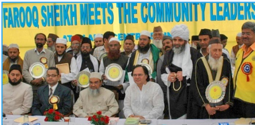
Farooque Shaikh with community leaders gathered from 25 districts of Uttar Pradesh.

Other celebrity visits on the anvil are cricketers' visits to Bihar and New Delhi and Farooque Shaikh's visit to the Agra-Ferozabad region which is being regarded as a "danger zone" for now.