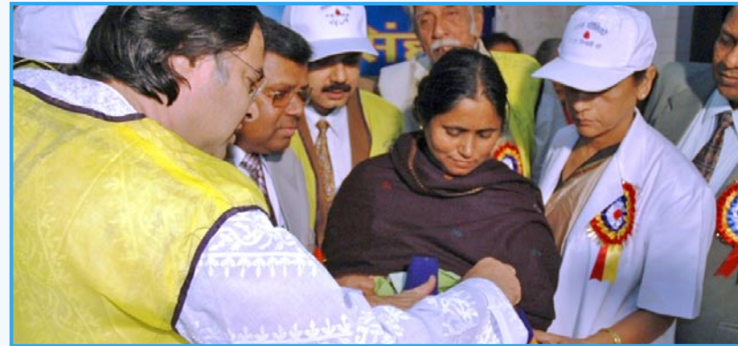
Farooque Shaikh immunises a child at the launch of the polio round in Lucknow on November 25

The recent series between the cricket the India and Pakistan cricket teams is being utilised for the benefit of polio and two events have already been held. While Indian players are participating in events related to polio, players from the Pakistan team too have immunised children and voiced their views on the urgency of polio eradication.