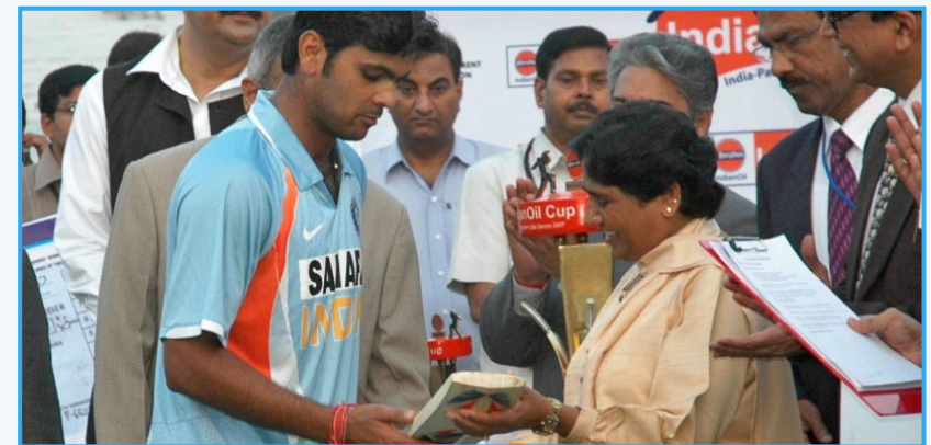
Indian cricket team player R.P. Singh presents a "Bowl out Polio" bat to Uttar Pradesh Chief Minister Ms. Mayawati.

With the cricket teams playing in New Delhi, a unique opportunity came up to have them immunise the children on the eve of the sub-national immunisation days (SNID). The turn-out was impressive. While the entire Indian cricket team turned up