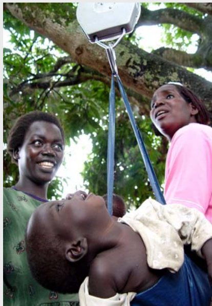
A mobile clinic worker weighs a child in Bobi IDP camp, Gulu, while the mother observes.

In 2005, UNICEF and its partners trained approximately 2,300 community-based health volunteers and provided them with enough first-line treatment drugs to treat 300,000 children under five for malaria, pneumonia, diarrhoea and other diseases in 70 percent of the IDP camps. Approximately 48,000 children and women in Gulu District's largest camp have benefited from Oral Rehydration Salts, water purification tablets and other supplies for the prevention and treatment of cholera. UNICEF has supported the distribution of 5,000 clean-delivery kits and insecticide-treated mosquito nets to pregnant women receiving antenatal care, and has provided therapeutic milk and biscuits to 11 Therapeutic Feeding Centres (TFCs) to assist more than 8,000 severely malnourished children.