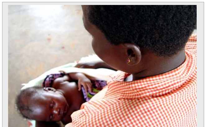
A formerly abducted girl and her child, conceived and borne in LRA captivity.

UNICEF assistance in 2005 has enabled approximately 300 formerly abducted children (including 150 "child mothers") to receive psychosocial and other assistance upon returning from LRA captivity, and to be reunified with their families. Currently, 230 teenage mothers (formerly abducted as well as unmarried girls) are receiving peer counseling and child-care training directly from 40 "child mothers" in IDP camps in Pader District. 250 formerly abducted children (including 45 "child