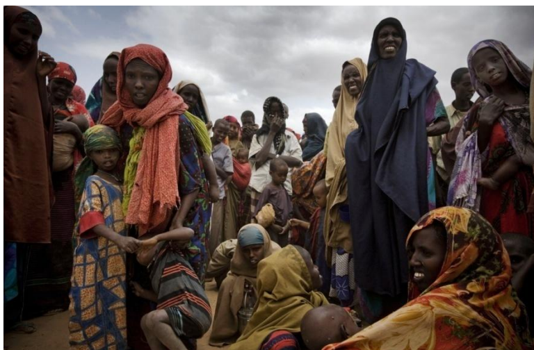
Kenya, 2011

Current estimates indicate that 554,508 children under five are acutely malnourished (434,364 suffering from moderate acute malnutrition and 120,144 from severe acute malnutrition), an increase from 476,000 at the beginning of the year (representing over 16 per cent increase). The south, currently in Critical to Very Critical phases according to The Food Security and Nutrition Analysis Unit - Somalia (FSNAU), is worst affected, hosting 75 per cent of the acutely malnourished and 80 per cent of all the severely malnourished children. This is one of the worst nutrition situations in the world. In some areas of the south, one in three children is acutely malnourished.