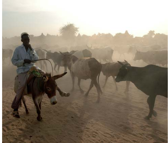
The conflict is affecting the livelihoods of all Darfur residents including nomadic populations. Here a herd of cattle pass through Dorti, West Darfur.

Getting caught between rebels and militia is only one of the potential threats facing close to 10,400 (930 international) aid workers currently operating in Darfur. More frequent incidents include detention by rebel groups insisting on proper notification regimes, banditry and ambush on major transportation routes as well as harassment by government officials in major capitals.