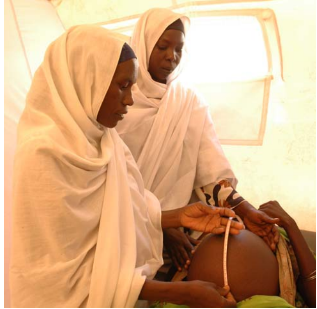
Healthy Mothers Make Healthy Babies. Medical staff perform an antenatal check up in a MSF health clinic supported by UNICEF in Dorti IDP camp, West Darfur.

UNICEF also aims to increase routine EPI coverage rates for under-ones to at least 60% in 2005. According to MoH reports for the entire year of 2004, for the entire under-1 population of Darfur (not just conflict affected), approximately 55% of the children