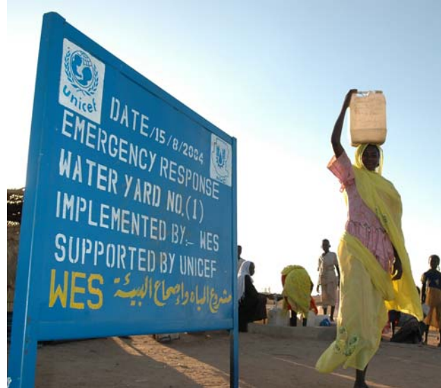
UNICEF works in partnership with the government not only for implementation but to increase human and technical capacity.

Another area of concern was vector control and solid waste disposal, especially for the larger camps of North Darfur. In the past, UNICEF provided limited support (per diem for spraying labours) to chemical spraying activities in Darfur since WHO supported the State MoH for these activities in 2004. As a result, large IDP locations (Abu Shouk, Zam Zam, Kassab, Kutum, Saraf Umra and Kabkabiya) were sprayed once or twice per month.