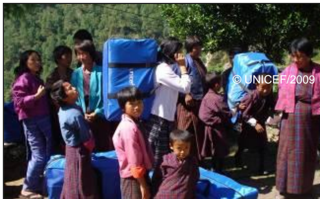
Affected families in Bhutan receives Emergency Family kits

Emergency water kits with collapsible water tank bucket, soap and water purification tablets are being procured and hygiene education is being provided. Affected children will receive necessary psychosocial support and basic protection, based on the recently concluded assessments.