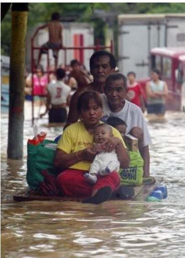
A family sits atop a raft, which is being propelled by a man wading through waist-high floodwater, in Pasig City in Manila, the capital.