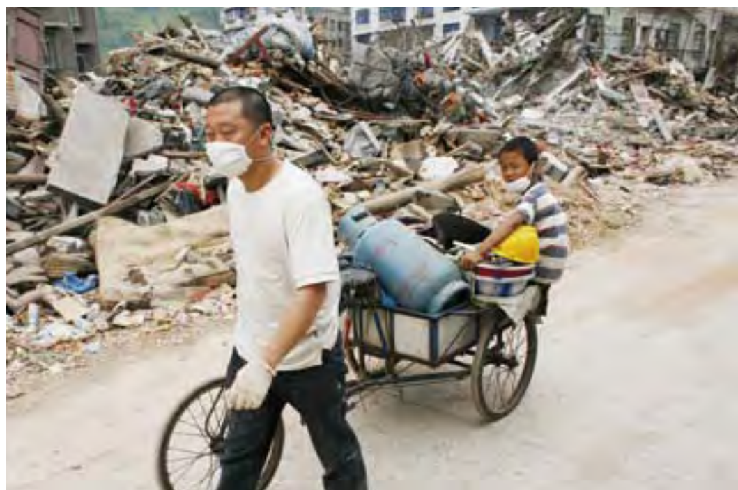
On 20 May 2008, a father and son in the town of Hanwang, Sichuan Province, transport belongings salvaged from their home, which was destroyed by the earthquake.

UNICEF's support to recovery efforts will continue up to 2011, in line with the government's three-year Restoration and Reconstruction Plan.