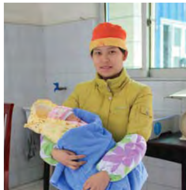
A mother holds her one-month-old baby girl as they wait to receive a health check at Anxian County Maternal and Child Care Centre, Sichuan Province.

UNICEF is now working with counterparts to expand the pilot micronutrient intervention to 14 earthquake-affected counties, benefiting 25,000 infants and young children aged 6 – 24 months. The intervention aims to achieve 80% coverage of the supplements in the project areas and reduce