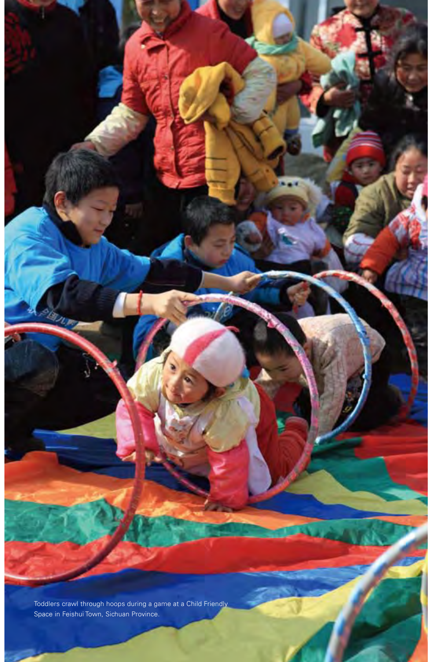
Toddlers crawl through hoops during a game at a Child Friendly Space in Feishui Town, Sichuan Province.