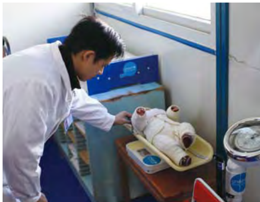
A paediatrician weighs a 45-day-old infant at Qingchuan County Maternal and Child Care Centre, Sichuan Province.

The earthquake struck areas that are predominantly poor, where the health and nutrition conditions of children and women were below national averages even before the emergency. UNICEF-supported surveys in 2006 found that in the poorest rural areas of Sichuan, Gansu, and Shaanxi Provinces, less than 60% of surveyed mothers received adequate antenatal care, nearly 50% of babies were delivered outside of a hospital setting, and less than 40% of infants were exclusively breastfed during the first six months of life. The survey also found that vaccination coverage in the earthquake-affected areas was far below national averages, with only 32 – 55% of surveyed children having received all necessary vaccines. A UNICEF-supported nutrition survey in Sichuan Province's Beichuan and Lixian Counties, completed in August 2008, found that the prevalence of anaemia among children aged 6 -24 months was 63%, nearly double the national average in rural areas. The survey also found that the prevalence of stunting among infants and young children was 13.9% and the prevalence of underweight was 9.1%. The survey underscored the vulnerable pre-existing nutritional status of the population and its probable deterioration after the earthquake.