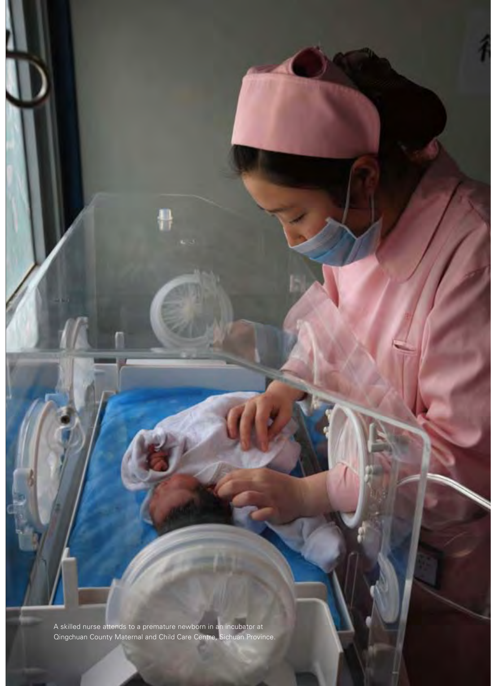
A skilled nurse attends to a premature newborn in an incubator at Qingchuan County Maternal and Child Care Centre, Sichuan Province.