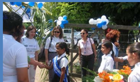
Student government president receiving a delegation at her school.