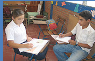
Boys and girls studying together at Victoria Rayo school.

More importantly, teachers and parents now pay special attention to what is being taught.