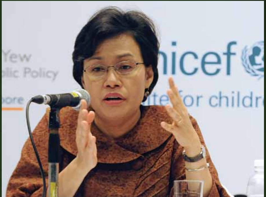
KID TALK Indonesian Minister of Finance, Sri Mulyani Indrawati, at a recent UNICEF conference in Singapore. Asian governments should invest in programs to protect millions of children likely to be hit hard by the global economic downturn despite budgetary constraints, a UN conference heard.

After the Asian financial crisis, many governments recognized the importance of social protection. For example, Thailand introduced greater unemployment benefits, pensions, universal health care, and unemployment insurance. The Government