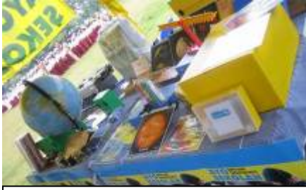
Some of the teaching materials provided by UNICEF.

counterparts, as well as UNICEF staff from the construction, education and water and sanitation sections and which resulted in a common action plan. (See also News from Aceh and Nias on the following page.)