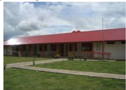
SDN Simpang Keuramat, host of the BTS campaign launch 2007

As a second part of the campaign, UNICEF is distributing teaching aids in 11 districts. The materials cover the subjects of Math, Science and Social Science, and will help teachers at 420 schools to improve the quality of their lessons. Education officials, local representatives, principals and teachers are also receiving training on making schools and communities more child friendly, and UNICEF has already reached over 2686 teachers with its teacher training program. Together with the Ministry of Education, UNICEF is working on developing a 5-year-strategic education development plan, to improve the quality of education in this province in the long-run.