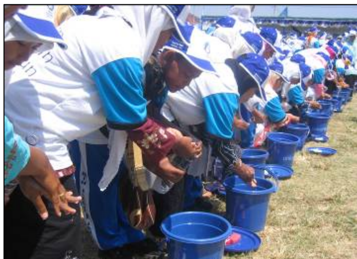
Let’s wash hands with soap! 500 children and their mothers show how!

The event was one of the highlights of a massive campaign called “Come on, wash your hands!” designed to promote adequate hygiene behaviours in Aceh. It is part of a nationwide campaign initiated by the Indonesian Government in partnership with UNICEF and ESP-USAID. The campaign contains conducting intensive mobilization in schools, media coverage for advocacy and peak ceremonial events in Aceh and five additional provinces throughout Indonesia similar to the one in Bireuen.