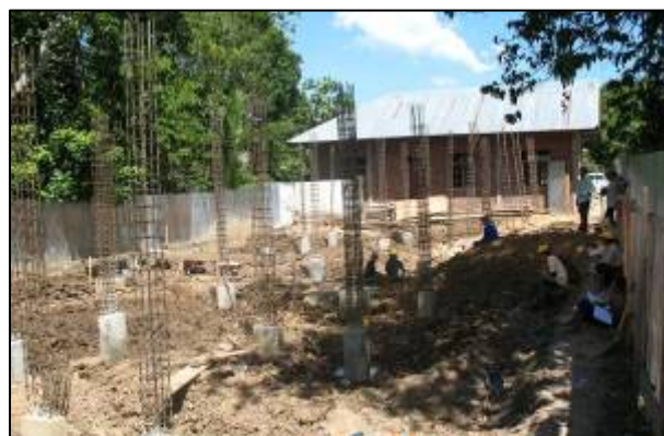
Construction is underway in the village of Ulee Tuy.

UNICEF also focuses on training several government counterparts at the district and province level on supervision, monitoring, evaluation and advocacy of the posyandu program. The midwives working at the health centers receive training in normal delivery care; counseling and interpersonal communication and breastfeeding counseling, among many other aspects.