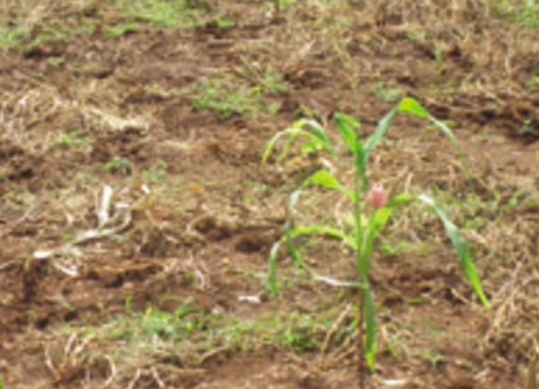
A child's photo of a lone corn stalk struggling in dry ground in Nusa Tenggara Timur province