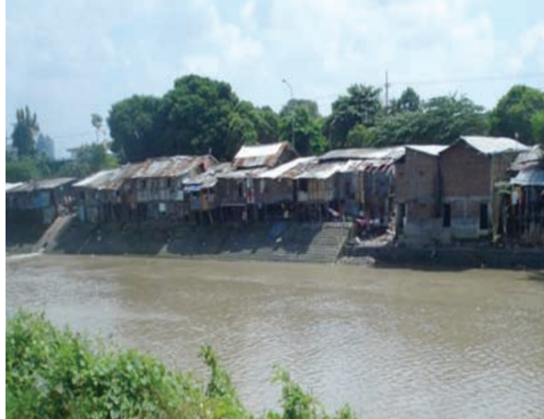
Settlements of Madurese migrants along the river in Surabaya City, East Java