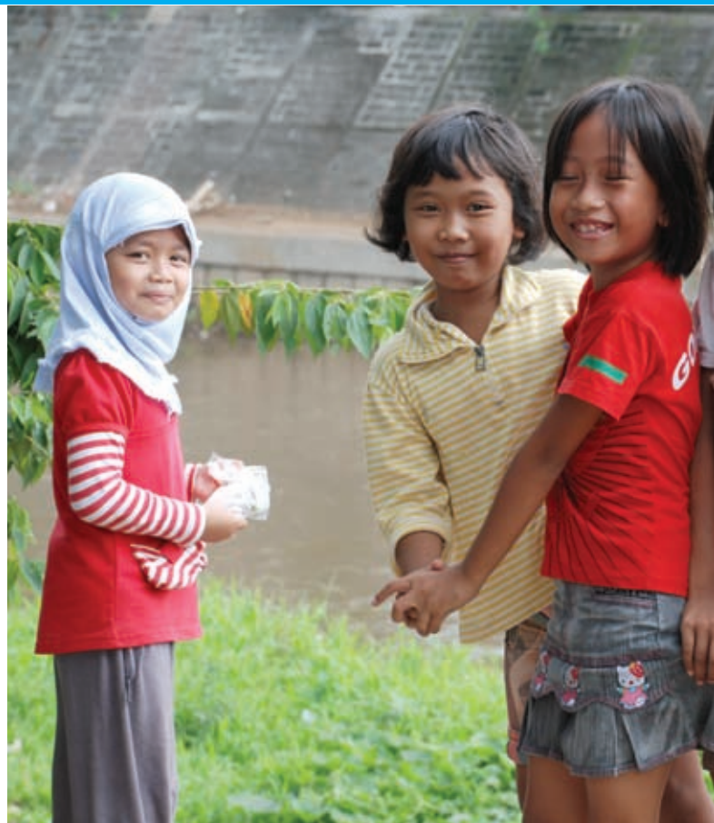
Group of girls playing on the banks of the Ciliwung River in Jakarta

The United Nations Convention on the Rights of the Child guarantees every child the right to a standard of living adequate for their physical, mental, spiritual, moral and social development and the right to the highest attainable standard of health. It also prescribes children's right to access information and for their views to be heard. The impacts of climate change are already and will continue to affect how well those rights are fulfilled and thus the future strength of the society in which they live.