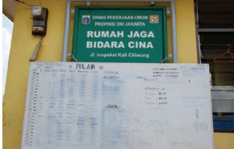
Watch house along the Ciliwung River in Jakarta, which posts the monitoring results for the river flow and rainfall upstream

Despite the scarcity of data, the field consultations suggest possible links between climate change and changing migration patterns for Indonesia and their specific effects on children. These include the increase in the