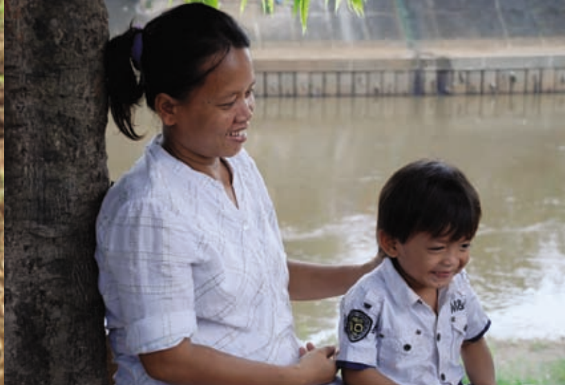
Mother and son in Jakarta

Without accounting for climate change, Indonesia has long struggled with high levels of malnutrition among children and women of reproductive age, and it has among the highest out-migration rates in South-East Asia. Nutrition and migration describe the essence of a child's health status and the degree of their social protection. They are determinants of a child's survival, of their physical, cognitive and social development and of the foundations for realizing their potential. The impacts are lifelong.