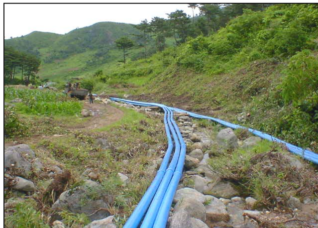
Gravity water system under development in Kosan County, Kangwon Province

Water supply systems have continued to degrade during the eight years since the beginning of humanitarian action in the DPRK. Though 83% of the population access drinking water through piped systems, it is estimated that these only serve 20-50% of needs today, depending on the location. Among the problems faced are the degraded quality of the pipes and pumps – in Hyesan, only 2 out of 12 pumps are now functioning – but also chronic shortages of energy, limiting the amount of time pumps can function. New ideas are needed, and UNICEF has some.