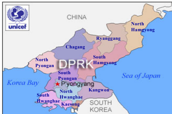
The boundaries and names shown do not imply official UN endorsement.

More talks towards a resolution of the dispute over the Democratic People's Republic of Korea's (DPRK) nuclear programme are expected soon. Should these talks, involving China, the DPRK, Japan, Republic of Korea (ROK), Russia and the USA, succeed in resolving the nuclear issue, there could also be a package of much needed rehabilitation and development assistance for the DPRK. Although the humanitarian programme has proved highly successful, as shown in the results of the 2002 nutrition assessment, it has not been able to tackle many of the structural causes of the crisis. Notably little has been achieved of any scale to rehabilitate aging drinking water supply systems and crumbling social infrastructure or to resolve chronic energy shortages. These all contribute to prolonging and exacerbating the suffering of children and other vulnerable groups in the DPRK.