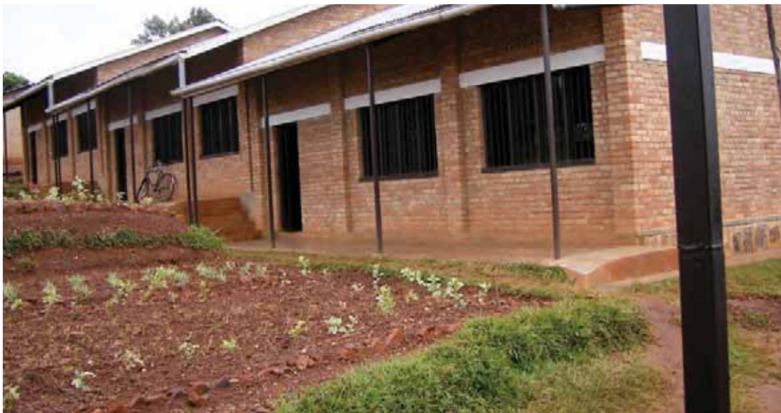
An older school building in the Rubingo Primary School complex in Rwanda (top). The bottom photo shows a new CFS building in the same complex.