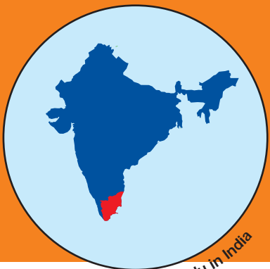
Tamil Nadu in India