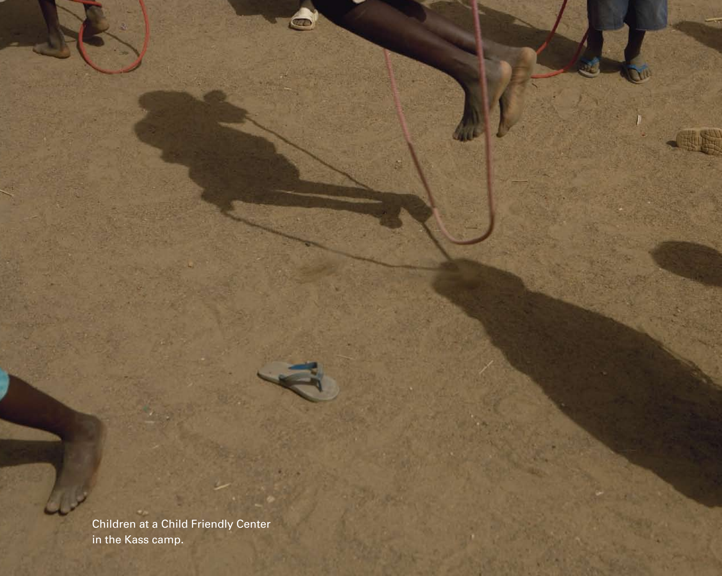
Children at a Child Friendly Center in the Kass camp.

A recent report from the UN High Commissioner for Human Rights said that in almost one in three reported rapes, the victims were children, and a recent UNICEF/ UN Population Fund study suggests that the number might be even higher. The immediate impact of these rapes is life-threatening and horrific for the victims. They are also attacks on the very fabric of families and communities, extremely painful events that add to the endemic feelings of humiliation and powerlessness. Longer-term concerns centre on healing the physical and mental wounds, and raising children born as a result of rape whom communities are reluctant to accept as their own.