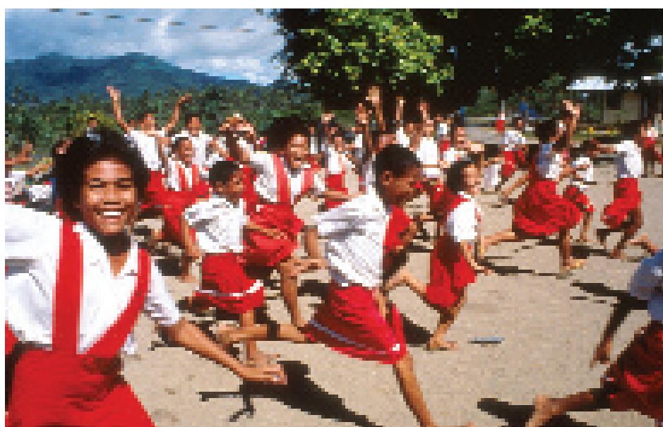
Samoan schoolchildren at play, Apia, Western Samoa

In the Pacific, the challenges to accomplishing these goals are great. But political, religious and civic leaders in the Pacific are grasping the immense threat AIDS poses to the survival of their people, cultures and societies. In order to guarantee that survival, the Pacific island countries must focus their efforts on the very embodiment of hopes for the future: their children and young people.