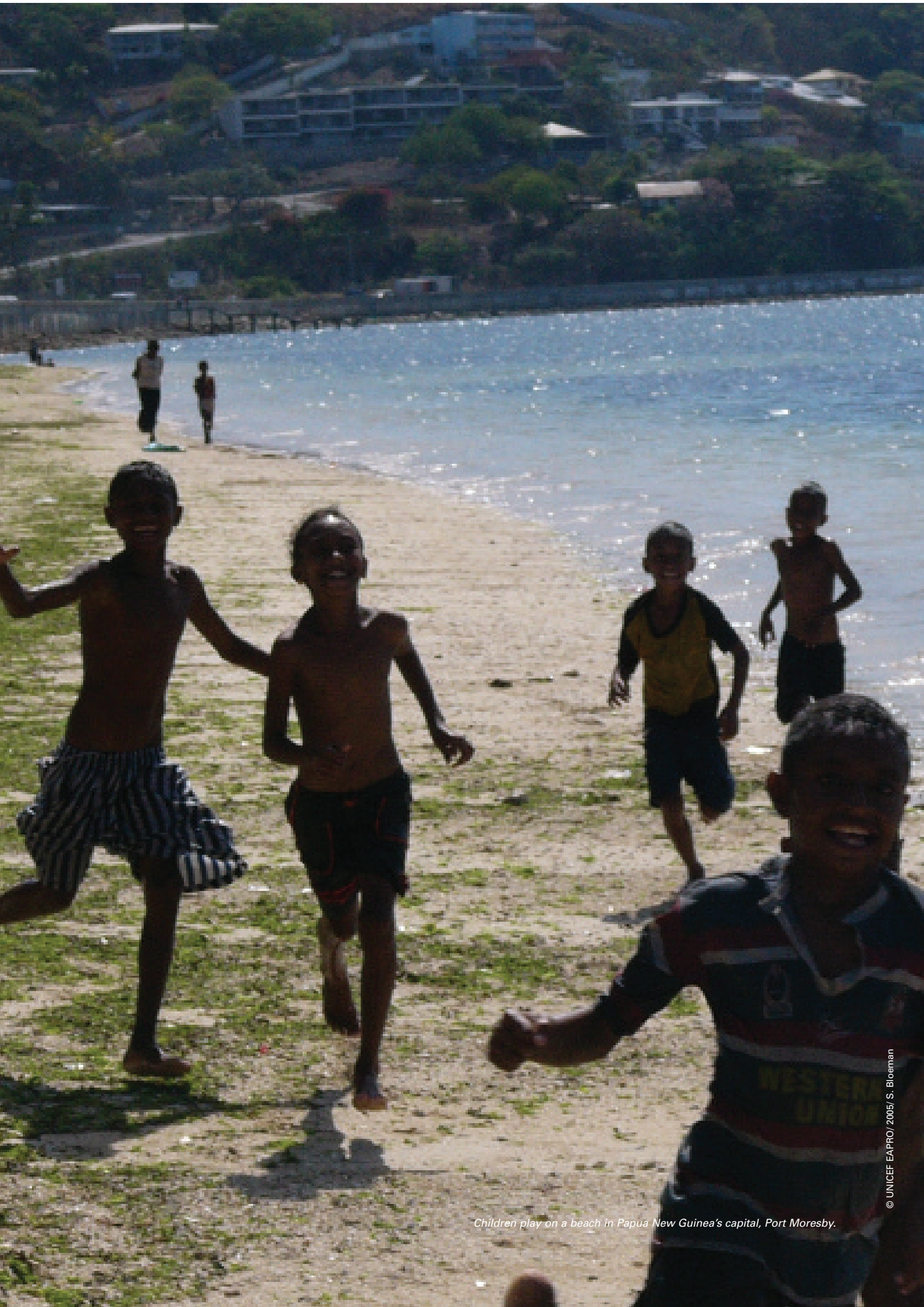
Children play on a beach in Papua New Guinea's capital, Port Moresby.