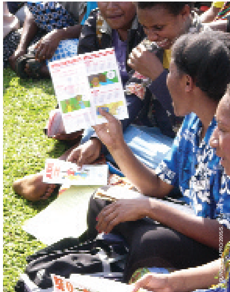
An AIDS awareness-raising session in Port Moresby

HIV incidence varies from country to country among 22 Pacific island countries. As of December 2004, there were 1,028 cases in the Pacific excluding Papua New Guinea. But, as with Papua New Guinea, cases in the other countries are likely vastly underreported because of weak surveillance systems, lack of access to voluntary counselling and testing, and persistent stigma and discrimination of people living with HIV. Moreover, low numbers still spell devastating consequences for these sparsely populated countries. A generalized epidemic in the Pacific excluding Papua New Guinea would only require 20,000 HIV cases – the equivalent of the entire population of Palau or the student population at the University of the South Pacific.