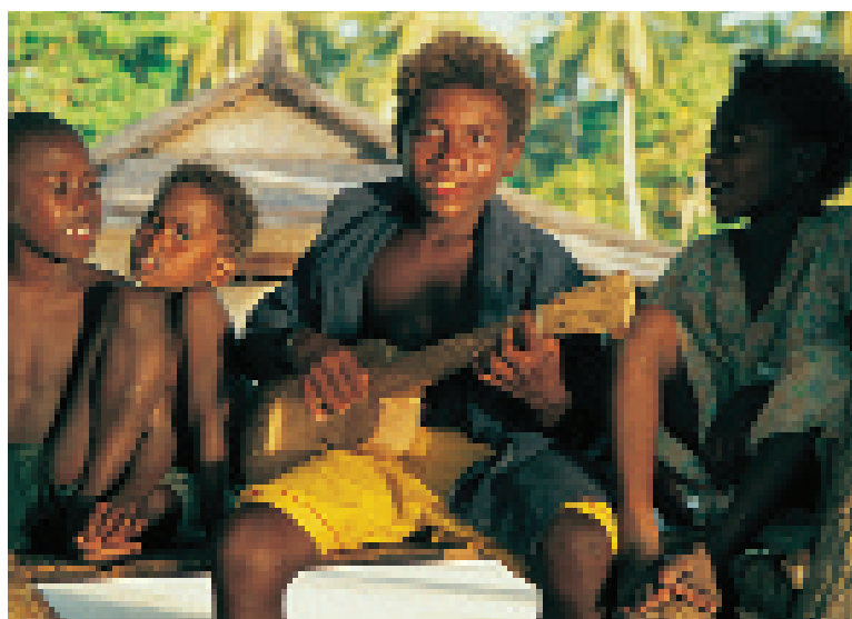
Solomon boys, Honiara, Solomon Islands

Because of stigma and discrimination, HIV is shrouded in shame and secrecy in the Pacific. Meanwhile, in some countries, taboos surrounding sexuality are so strong that teenage pregnancies and other sexual transgressions incur severe punishment – a consequence that discourages teenagers from seeking guidance and from buying condoms. Low levels of education are partly to blame for this