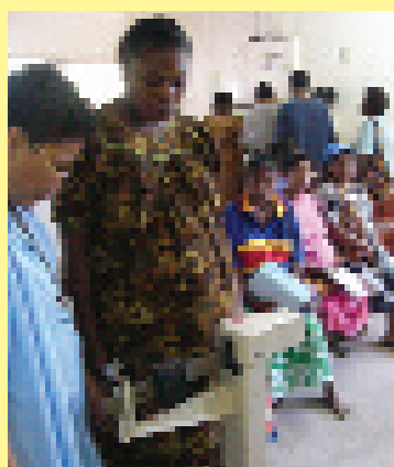
An expecting mother receives a check-up at Port Moresby's General Hospital.