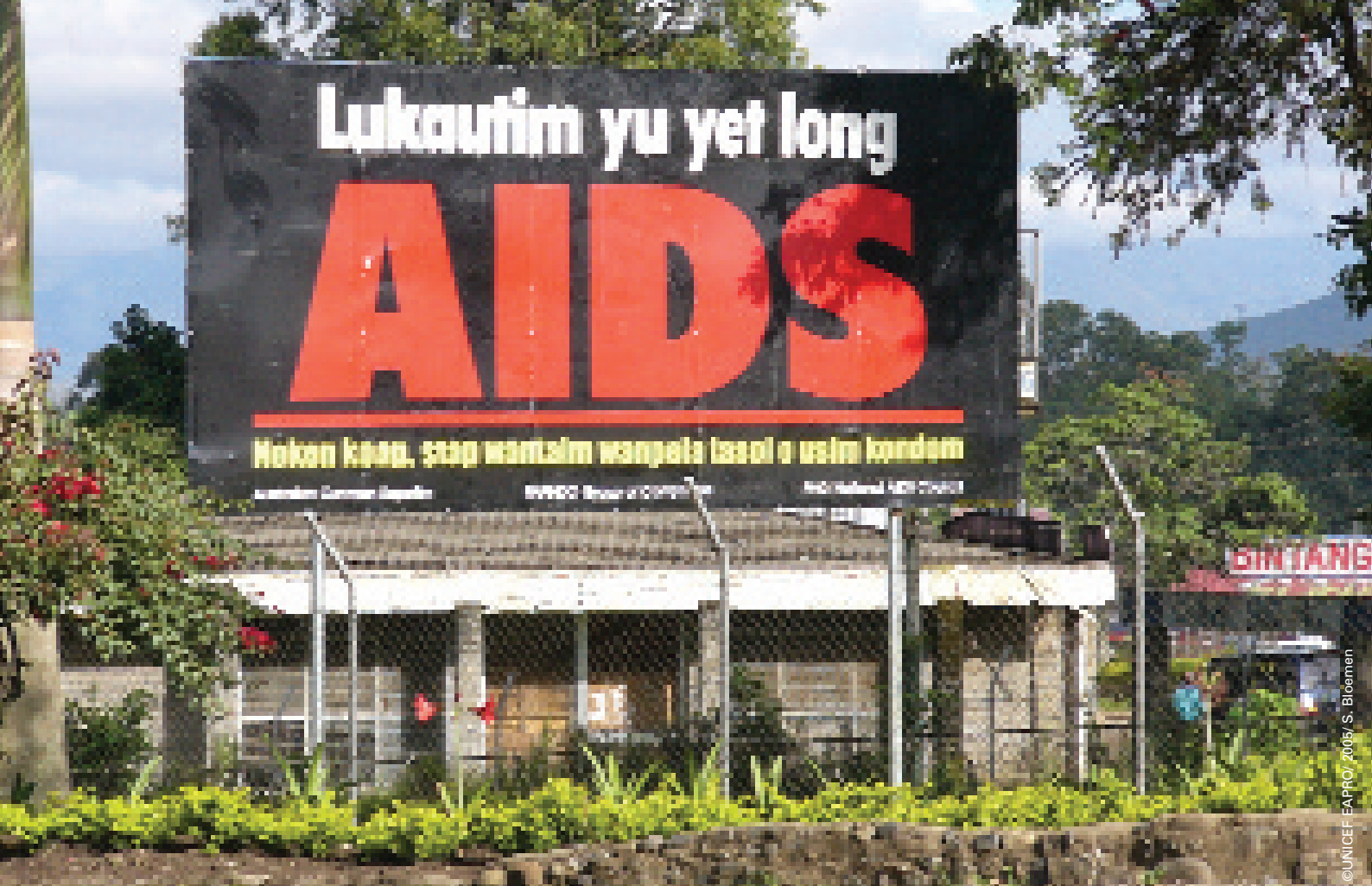
An HIV/AIDS awareness billboard in Port Moresby, Papua New Guinea