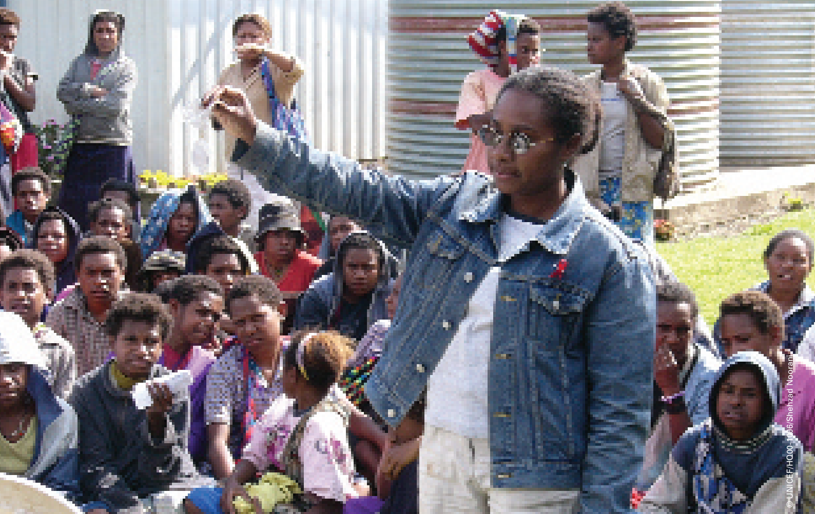
A demonstration on condom usage conducted by peer educators in Papua New Guinea

In order to achieve success, prevention programming must be complemented by universal access to condoms; child-friendly services; VCT services; early STI screening and treatment; and life-skills education, especially for girls. The Global Campaign will also prioritize keeping children, particularly girls, in school because that is one of the best ways to protect them and teach them about HIV prevention. To achieve that goal, one of the key components of the campaign in Papua New Guinea is advocating for universal primary education.