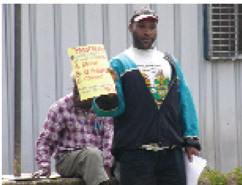
A peer educator discusses AIDS prevention measures in Papua New Guinea

Reducing gender disparities, gender-based violence, and in turn, HIV vulnerability requires the participation of both genders, and Pacific HIV and AIDS responses need to harness the potential of men and boys in order to ensure long-term success.