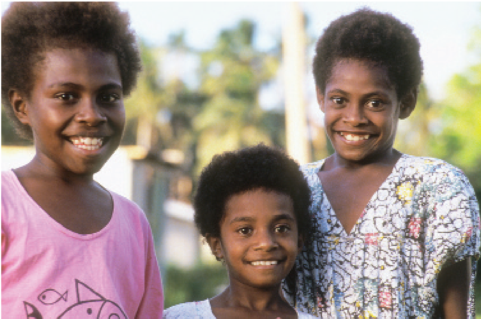
Ni Vanuatu girls, Eton Village, Vanuatu