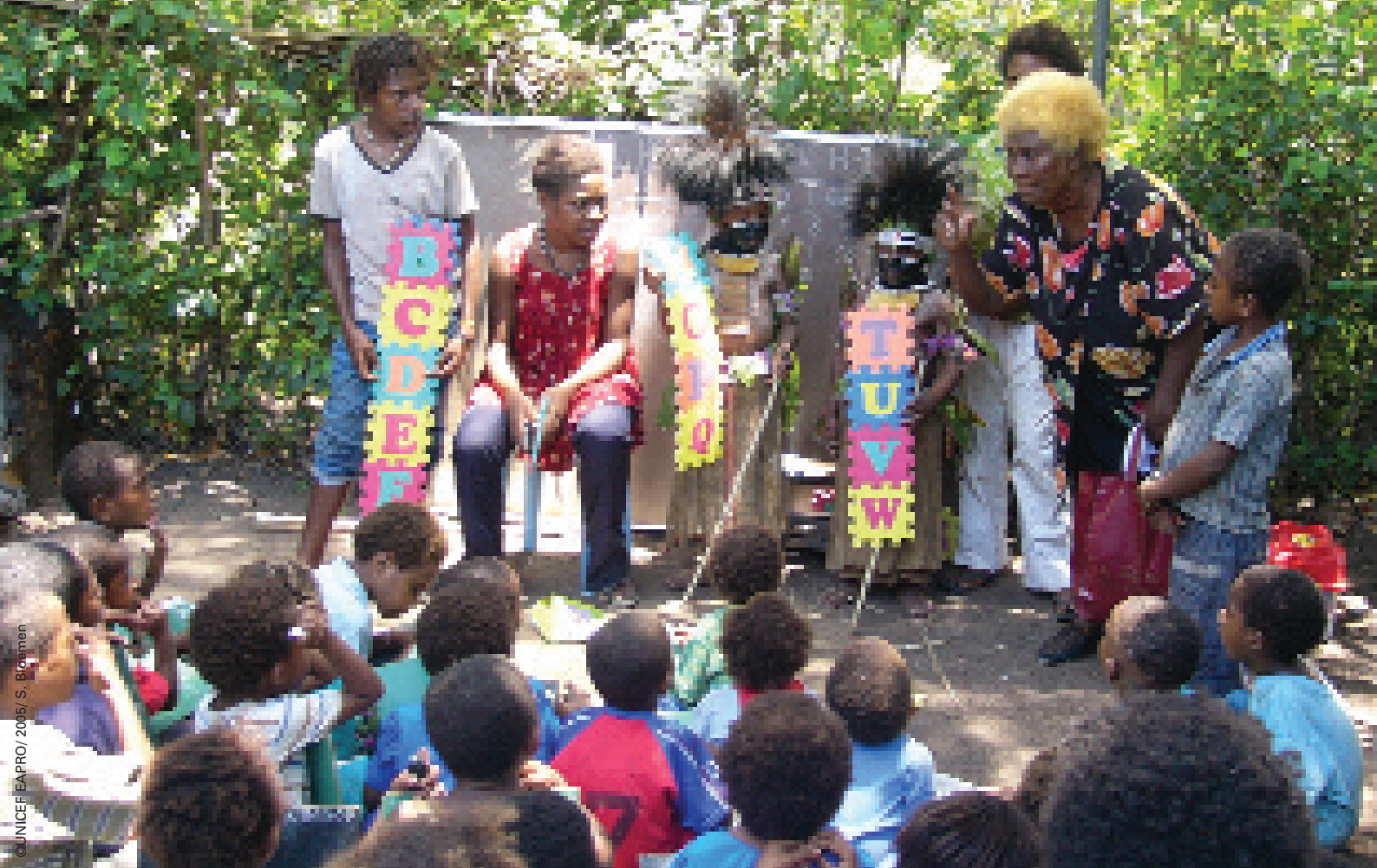
Children participate in a traditional drama performance at a child-care centre in Papua New Guinea for children who have lost their parents to AIDS.