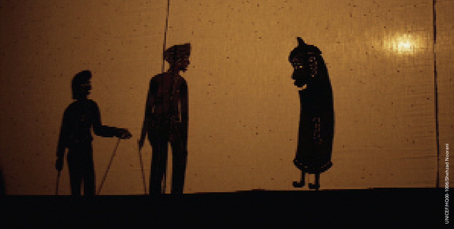
A shadow puppet show designed to educate youth on HIV/AIDS is performed by local artists in Phnom Penh, Cambodia in 2000.

Thailand is less rigorous than it was in the 1990s, and consequently, young people, particularly young women, often possess only a shaky knowledge of HIV/AIDS. 72 Gender discrimination in this region thwarts access to information for girls. Sex is often viewed as an inappropriate subject for discussion. And as mentioned before, girls are more likely to be withdrawn from school – a potentially effective outlet for knowledge about HIV prevention.