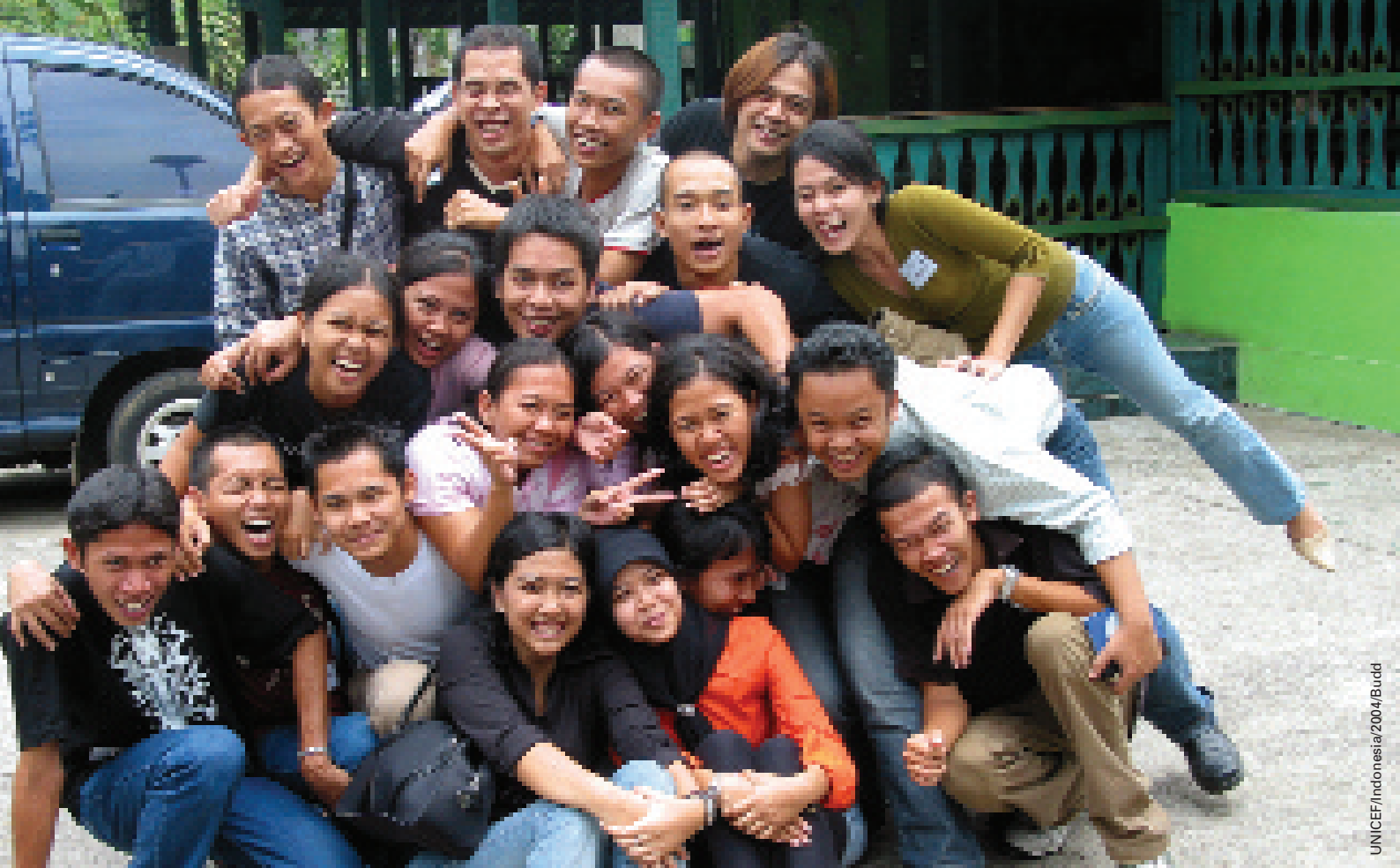
Peer group educators in Indonesia

an average of three times each. 29 All of them claimed to have first had sex between the ages of 12 and 14, and none had used a condom before. In Thailand, young people who drink or use methamphetamine are at high risk of HIV because substance use may impair judgment and result in having unprotected sex. 30 In Cambodia, among 11 to 18-year-olds who reported having had sex, 40 per cent did so after drinking alcohol. 31 Too often young people do not have the knowledge, skills or the confidence to obtain condoms or negotiate condom use, or simply lack access to condoms, further increasing their vulnerability to HIV/AIDS.