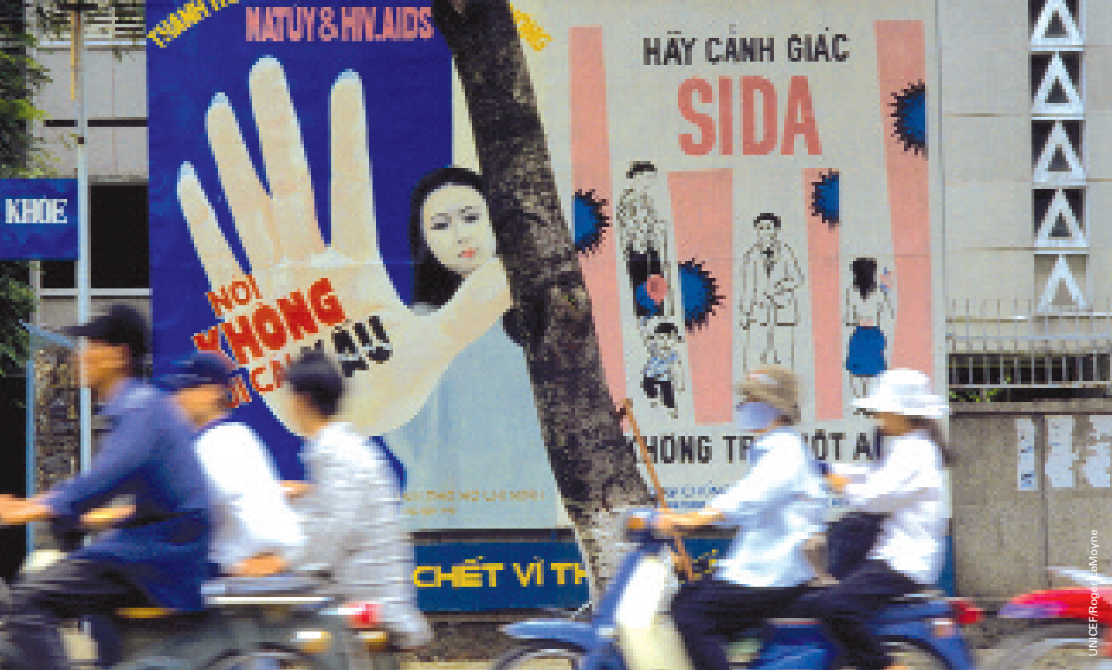
An HIV/AIDS awareness billboard in downtown Ho Chi Minh City, Viet Nam

Above all, this option must place children at the forefront of a comprehensive HIV/AIDS response. It has been proven time and time again throughout East Asia that targeting children and adolescents and allowing them to participate can effect change and reverse trends. Young people grasp the message of prevention quickly given the right support. Surveys show teenage boys in Cambodia are far more likely to use condoms than adult men while male youths in Thailand are less likely to visit sex workers thanks to aggressive prevention initiatives. 7